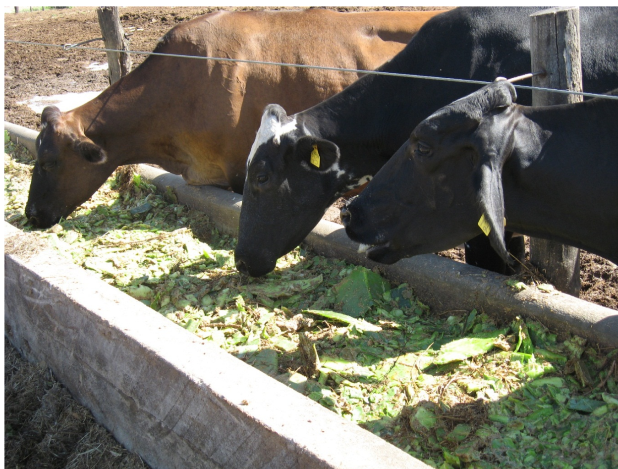
Figure 5. Dairy cows eating total mixed ration.

Changes in the amount of milk fat indicated that the production of saliva was probably also decreased, which would have subsequent effects on rumen conditions [51]. The NDF and NFC contents in the diet were 30.3% and 39.22%, respectively. These values are notably close to the limits recommended by the [25] for maintaining rumen health and milk fat. Thus, any changes in the proportion of feed components could significantly alter these values and the nutritional balance of the feed supplied to the animals. According to [52], the balance of structural and non-structural carbohydrates is important for animal health and function along with nutrient utilization, which is one of the intended goals of providing the diet as a complete mixture. A better utilization of energy for milk production was also observed when using a complete mixture feeding strategy, rather than supplying the ingredients separately [53]. A better utilization of energy for milk production was also observed when using a complete mixture feeding strategy, rather than supplying the ingredients separately (Figure 5)