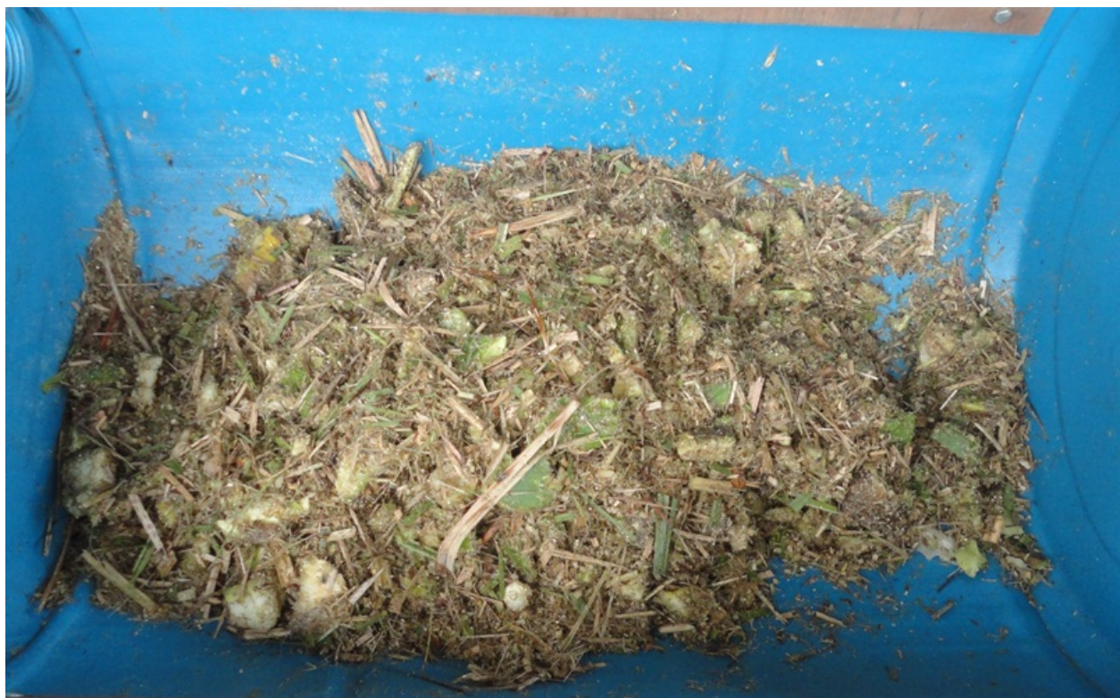
Figure 4. Total mixed ration containing spineless cactus

The most common approach to administering cactus to dairy cattle is mincing it in the trough without mixing it with any other roughage. The concentrate, when used, should be offered at the time of milking. When the feeds are supplied separately in this manner, it is not always possible to obtain an accurate estimate of the real intake of these feeds, especially when more than one type of roughage is consumed. This difficulty in measuring is due to a preference for certain feeds, making it difficult to calculate the average individual consumption and to characterize the diet ingested by the animal. It is important to stress that roughage rich in NFC, such as cactus, may cause a number of rumen disorders when provided separately and in large amounts. As a result, the use of the complete ration or TMR (total mixed ration) has become a common practice for regulating the composition of the diet [29]. These approaches also contribute to the supply of the diet, which should provide an adequate balance of nutrients. As a result, the use of the complete ration or TMR (Figure 4) has become a common practice for regulating the composition of the diet.