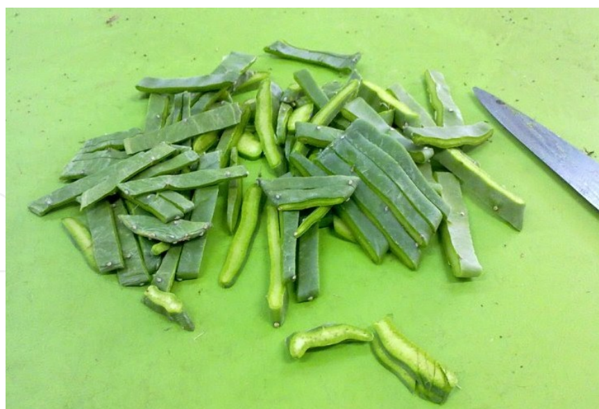
Figure 9. Spineless cactus minced with a knife