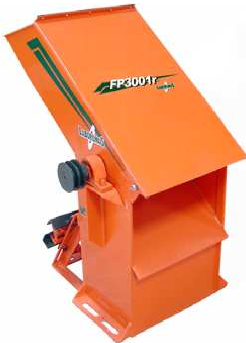
Figure 6. Forage machine

is that mincing with a knife does not lead to mucilage exposure, while the use of forage equipment does. When cactus was combined with sugarcane bagasse and soybean meal and fed to lactating cows, higher consumption rates were observed when the cactus was passed through a forage machine compared to processing with a knife (16.3 versus 15.2 kg/day, respectively) [54]. This result probably reflects the exposure of the mucilage, which adheres to the other feed components. As a result, feed selectivity is reduced, and consumption of the complete feed, including unpalatable components such as sugarcane bagasse, is facilitated. Animals that received cactus minced with a knife had a greater opportunity to select particular feed components, which resulted in an imbalance of structural and non-structural carbohydrates in the diet. In turn, this imbalance led to a reduction in milk fat compared to animals fed cactus processed using a forage machine (36 versus 39 g/kg, respectively).