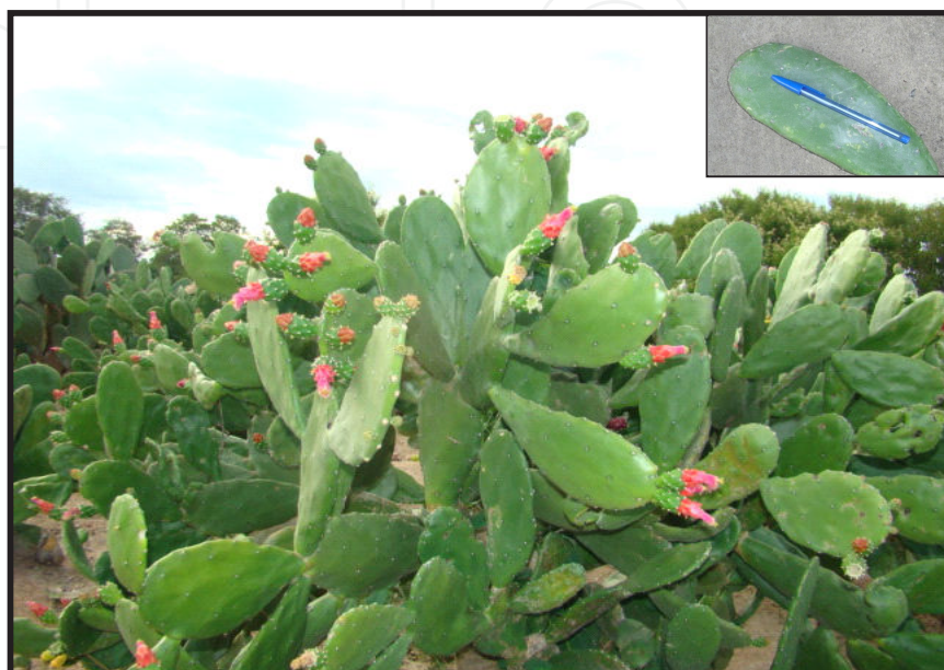
Figure 1. Palma Miúda – Nopalea cochenillifera Salm Dyck

the spineless cactus. Due to this low protein content and the high content of non-fibrous carbohydrates, the spineless cactus is an excellent replacement for a portion of poor fodder. The cultivars most used are: Palma gigante ( Opuntia ficus-índica – Mill), Palma miúda ( Nopalea cochenillifera Salm-Dyck) and Palma redonda ( Opuntia ficus-índica – Mill), where are illustrated in Figures 1, 2 and 3 respectively.