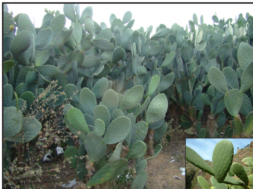
Figure 2. Palma Gigante – Opuntia ficus-índica Mill