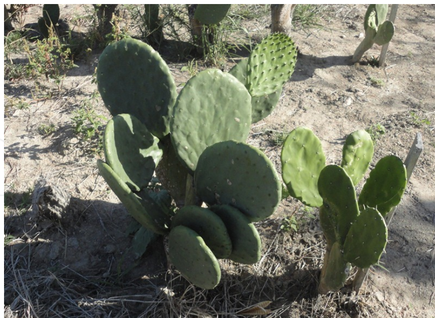
Figure 3. Palma Redonda – Opuntia ficus-indica - Mill

The high levels of calcium, potassium, and magnesium in cactus (Table 2) may reduce the absorption of these minerals, as well as limit microbial growth and the digestibility of different nutrients [19]. As with the majority of tropical forages, the amounts of phosphorous in cactus are considered low and insufficient for the needs of animals [20].