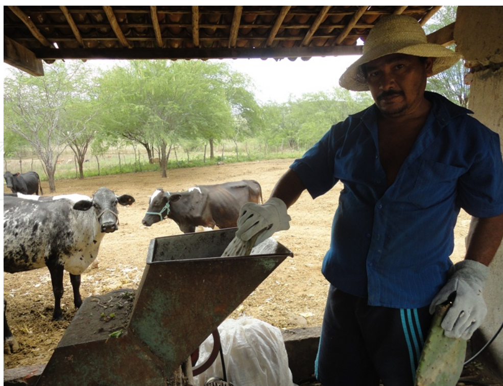
Figure 7. The laborer doing the process