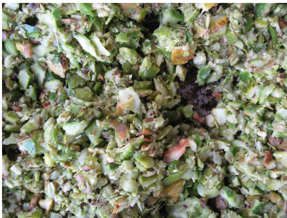
Figure 8. Spineless cactus processed in machine