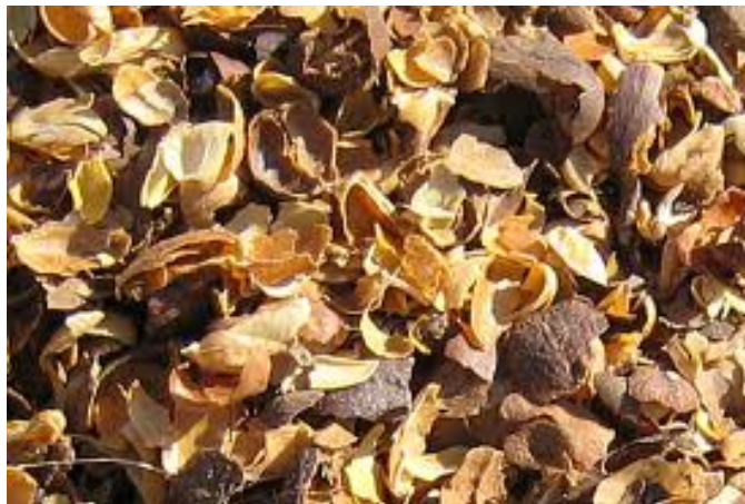
Figure 6. Coffee husk (Source of energy)