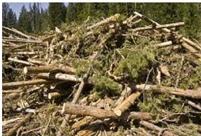
Figure 10. Forest harvesting waste at Sao Hill

There about 80,000 hectares of state owned plantation forest that are mostly linked to state owned wood based panel industry and the pulp and paper industry. It is estimated that there are 25,000 hectares of private owned plantations. In addition, more than 75,000 hectares belongs to villagers, local government, NGOs and civil societies. Hence, the estimate forest residue potential m^3 per year is about 205,400 tonnes. The residue can be used for modern energy conversion.