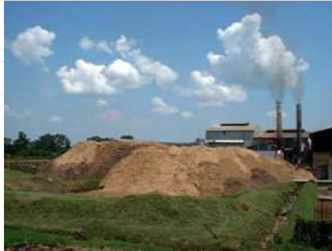
Figure 13. A heap of bagasse at Sugar Factory

Industrial waste such as bagasse (Figure 13) from sugar plants find application in co-generation process, which generates electricity that is used by the same plant. The excess is supplied to the nation grid