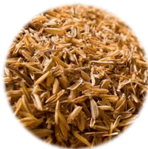
Figure 4. Rice husk (Crop residue)