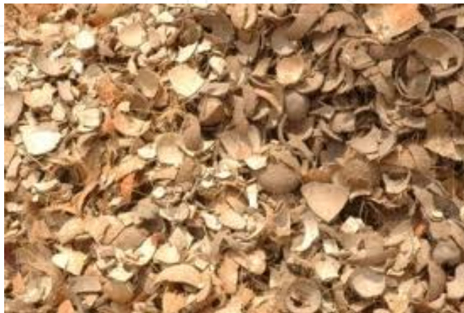
Figure 7. Coconut shells