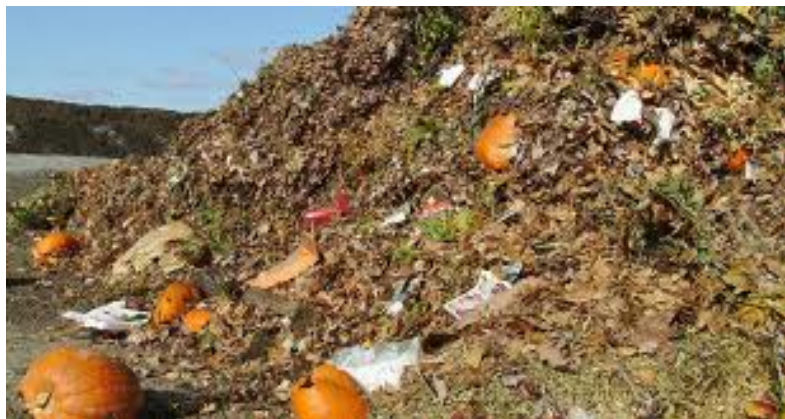
Figure 9. Heaps of Food waste in Urban Tanzania