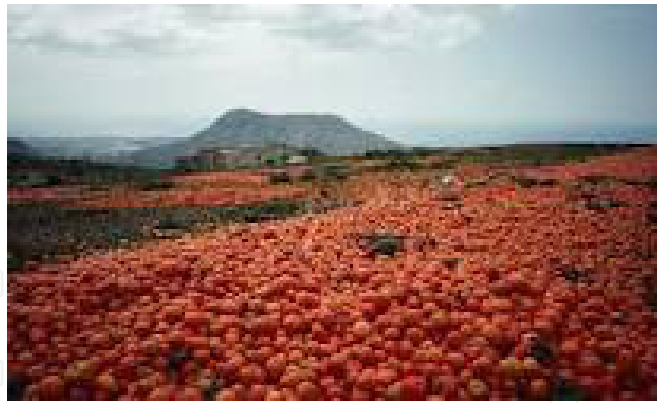
Figure 8. Surplus Tomato Left as Waste