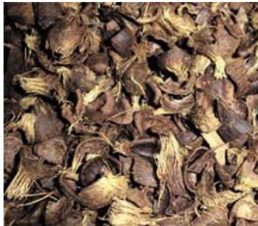
Figure 5. Palm Oil Shell