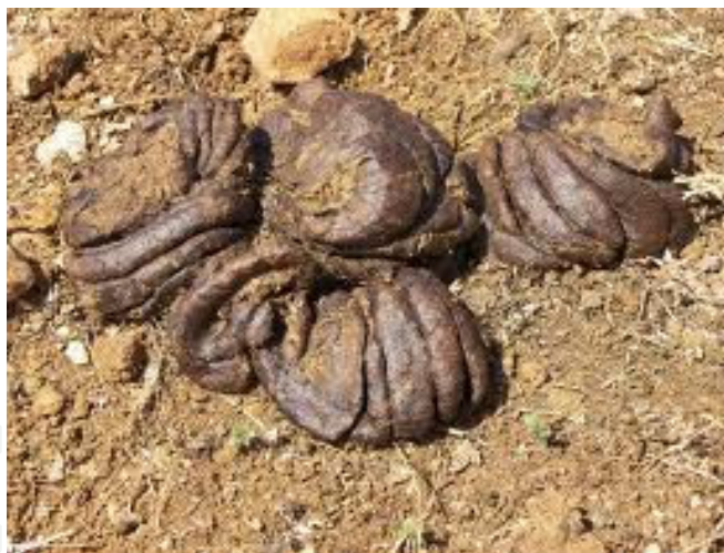
Figure 11. Cow dung

The challenge is how to quantify the energy potential from animal waste in the country. Advanced investigation is needed. Figure 11 shows cow dung, which is used as source of energy in rural areas.