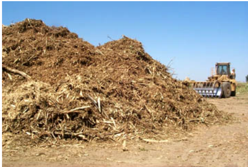
Figure 2. Biomass heaps (bagasse) in rural areas

There is an enormous biomass potential in the country such (Figure 2) as bagasse that can be tapped by improving the utilization of existing resources and by increasing plant productivity. Bioenergy can be modernized through the application of advanced technology to convert raw biomass into modern, easy-to-use energy carriers (such as electricity, liquid or gaseous fuels, or processed solid fuels). Therefore, much more useful energy could be extracted from biomass. The present lack of access to convenient energy sources limits the quality of life of millions of people, particularly in rural areas. Since biomass is a single most important energy resource in these areas its use should be enhanced to provide for increasing energy needs. Growing biomass is a rural, labour-intensive activity, and can, therefore, create jobs in rural areas and help to reduce rural-to-urban migration, whilst, at the same time, providing convenient energy carriers to help promote other rural industries.