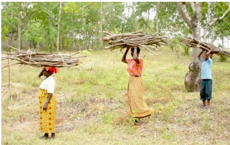
Figure 1. Women carrying firewood in rural Tanzania

Despite its wide use, biomass is usually used so inefficiently like firewood (Figure 1) that only a small percentage of useful energy is obtained. The overall energy efficiency in traditional use is only about 5-15 per cent, and biomass is often less convenient to use compared with fossil fuels. It can also be a health hazard in some circumstances; for example, cooking stoves can release particulates, \text{CO} , \text{NO}_x , formaldehyde, and other organic compounds in poorly-ventilated homes. Furthermore, the traditional uses of biomass energy, i.e., burning fuel wood, animal dung and crop residues, are often associated with the increasing scarcity of hand-gathered wood, nutrient depletion, and the problems of deforestation and desertification