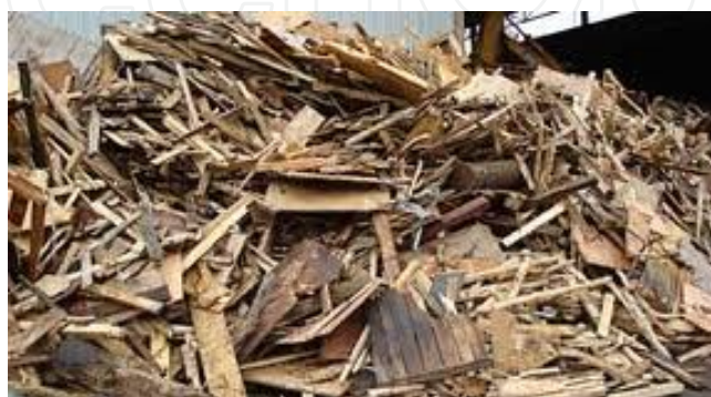
Figure 12. Wood waste in Mwanza Municipality

Such waste consists of lawn and tree trimmings, whole tree trunks, wood pallets and any other construction and demolition wastes made from timber (Figure 12). The rejected woody material can be collected after a construction or demolition project and turned into mulch, compost or used to fuel bioenergy plants