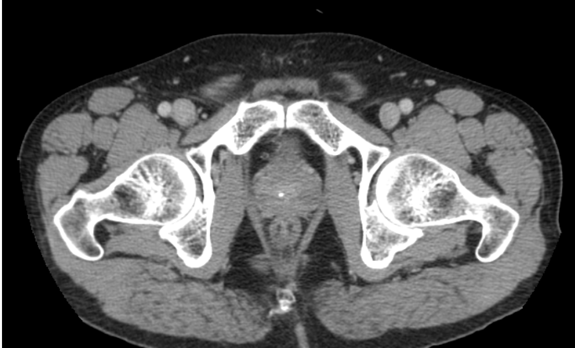
Fig. 3. Pelvic CT scan showing prostate stone in the prostate gland

prostatitis symptom scores were decreased [21]. However, there was no relationship between chronic prostatitis symptom scores and prostatic calculi or level of the histological prostatic inflammation [21].