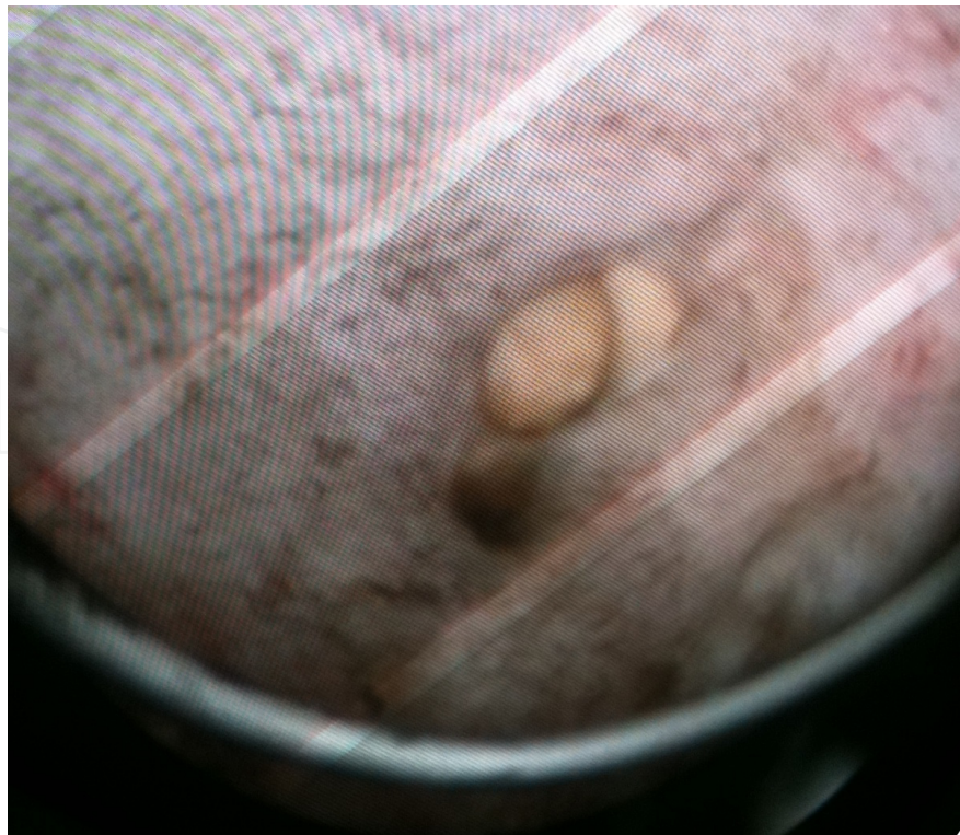
Fig. 4. Prostate stones encountered during TUR-P