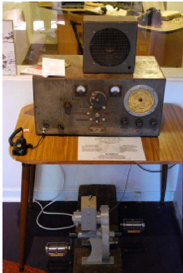
Fig. 1. Traeger pedal-driven radio

In its early manifestation, described in the early 1900, people living in remote areas of Australia used two-way radios, powered by a dynamo driven by a set of bicycle pedals, to communicate with the Royal 'Flying Doctor Service of Australia'.