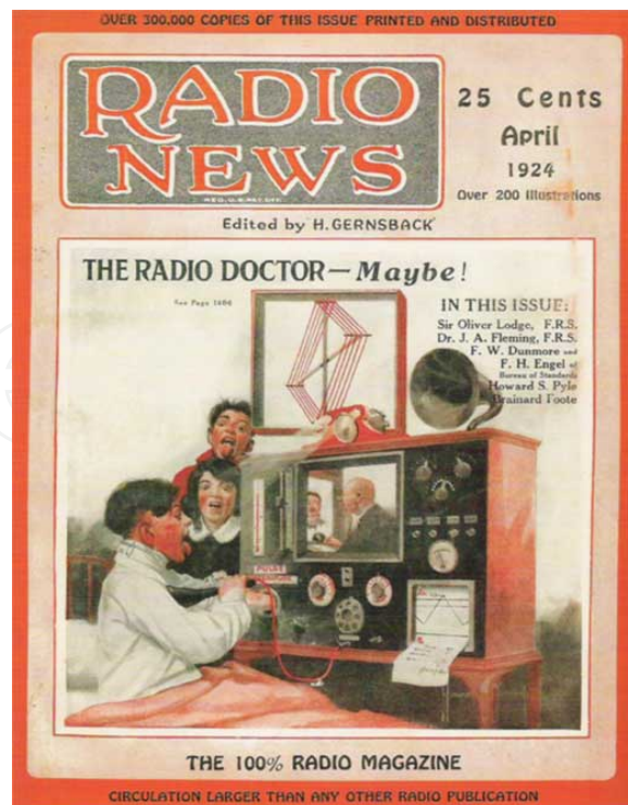
Fig. 2. "The Radio Doctor – Maybe!" Radio News, April 1924

Radio News magazine (science magazine of the mid-1920s) predicts the potential progress in telecommunication (radio, telegraph, telephone and television) in medicine ('Radio News', April 1924)