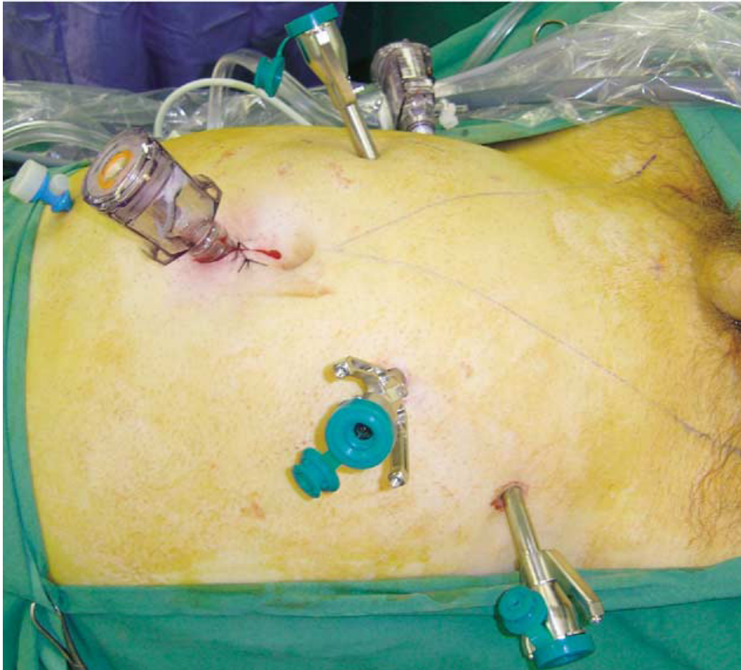
Fig. 4. Minimal Access Surgery Positioning of six ports in a keyhole operation (Van Appledorn S. et al, 2006).

The initial high complication rates associated with minimally invasive surgery and a lack of experienced endoscopic surgeons have raised concerns relating to training and, most importantly, patient safety, consequently, generating a doubt regarding the role of minimally invasive procedures in everyday clinical practice.