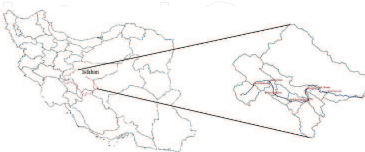
Figure 1. The location of Zayandehroud Basin in Iran

The Zayandehroud River is the most important river in central Iran which stretches over a length of 400 km, originating in the Zardkough Mountain and ending in the Gavkhooni swamp after passing through the city of Isfahan. The Zayandehroud River basin has an area of 41,500 square kilometres, and an average rain fall of 130 millimeters. There are 2,700 square kilometres of irrigated land in the Zayandehroud River basin, with water derived from the nine main hydraulic units of the Zayandehroud River, wells, qanat and springs in lateral valleys. The location of the study area is shown in Figure.1 [7].