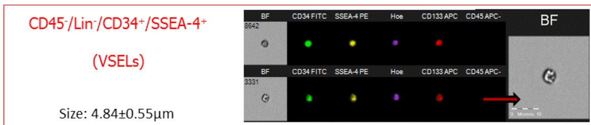
Figure 3. Very small embryonic-like cells extracted from the heart

pattern of pulsatile release of these hormones characterize the prolonged phase of critical illness. Cortisol levels remain elevated in chronic critical illness despite a decrease in ACTH release. The metabolic result of this neuroendocrine array is worsen metabolism of fatty acids and a propensity for fat storing and protein wasting. The immune effects related to neuroendocrine disturbances are impaired lymphocyte and monocyte function and increased lymphocyte apoptosis. It leads to catabolic state and multiple organ dysfunction. Duration of immune suppression correlates strongly with the incidence of related infection. Tissue damage and strong stressors (such as cyanosis, circulatory insufficiency) stimulate regenerative and reparative processes involving stem cells.