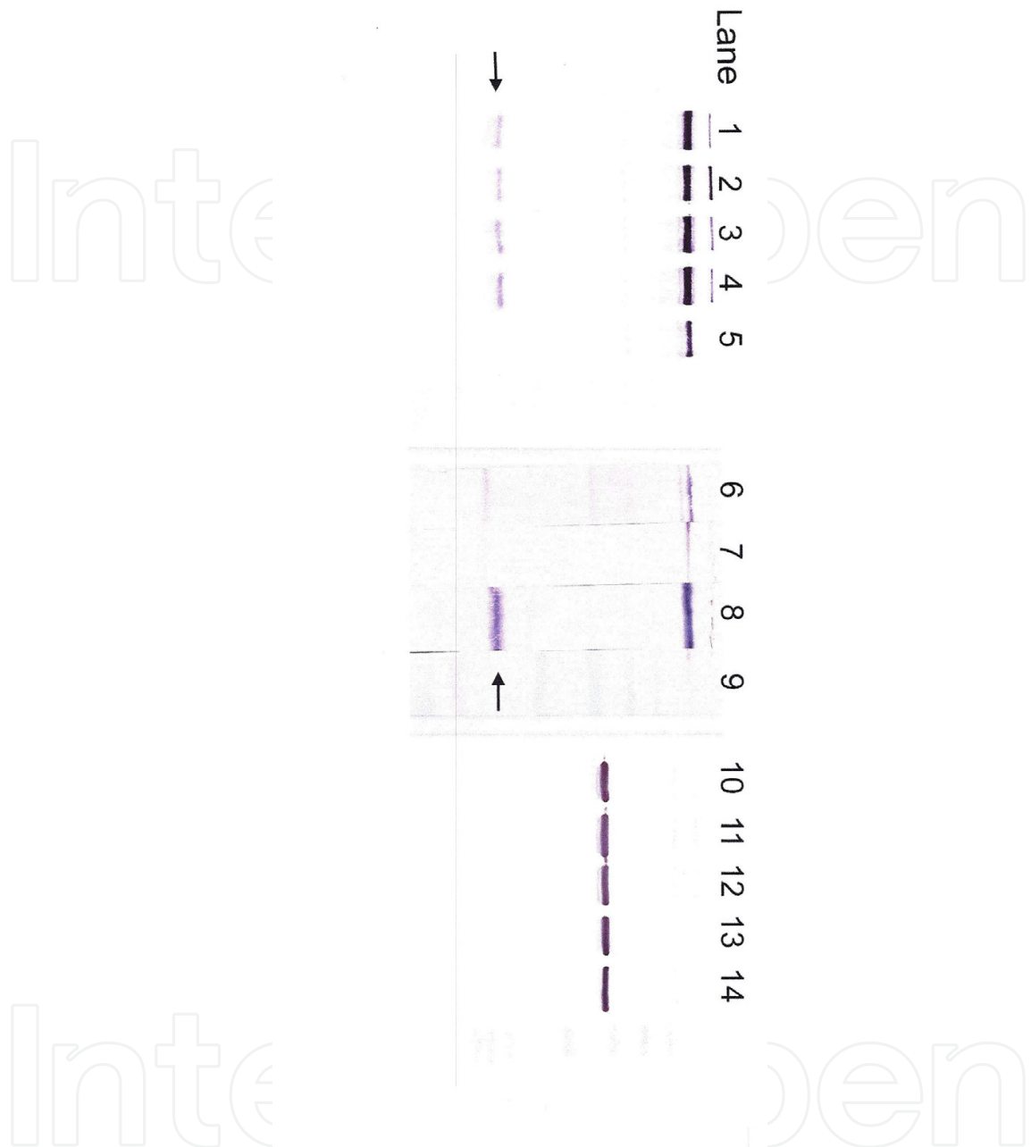
Figure 2. Demonstrates a series of experiments evaluating a 20 kD protein detected by anti-HER2 extracellular domain (AA 182-373) anti-sera at 48 hours. Lanes 1-5 demonstrate the full Western blot gel of BT-474 (48 hours, from Figure 1) showing two bands: the p185 HER2 protein and the 20 kD protein (arrow on left) lanes 1-4 . Note that this protein is not detected in lane 5 which represents lapatinib-treated cells, while the p185 HER2 is mildly reduced in lane 5 . Lanes 1-14 show the corresponding actin control confirming that equal numbers of cells were applied to lanes 1-5 . Exposing BT-474 cells to an acid wash of pH 4.0 does not elute the protein as lane 7 is the acid wash and the cell pellet that remains is shown in lane 6 , has both p185 and the 20 kD protein. Using the Triton X Perfect Focus Membrane Protein kit methodology shows a clearer picture of localization of the 20 kD band with membrane HER2 protein and the 20 kD band (arrow) both in lane 8 (membrane protein concentrate) and corresponding cell pellet, run in lane 9 , is negative.