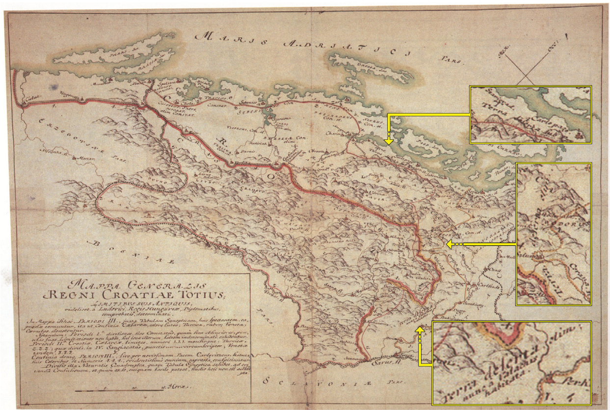
Figure 4. Vitezović's Map of the whole Kingdom of Croatia, 1699, facsimile in [19] " Terra deserta olim nunc a Valachis habitata " and " Terrae desertae " along the borderlands. Emphasized by the author.

Triple border and "meeting point" of different political systems on the territory of Croatia conditioned different imaging of the borderland through a medium of cartography. These images are politically informed and valued and often directly opposed, giving legitimacy, importance and power to one side and ignoring and silencing the other. Thus, these examples show that the rhetoric of map include also the concept of otherness.