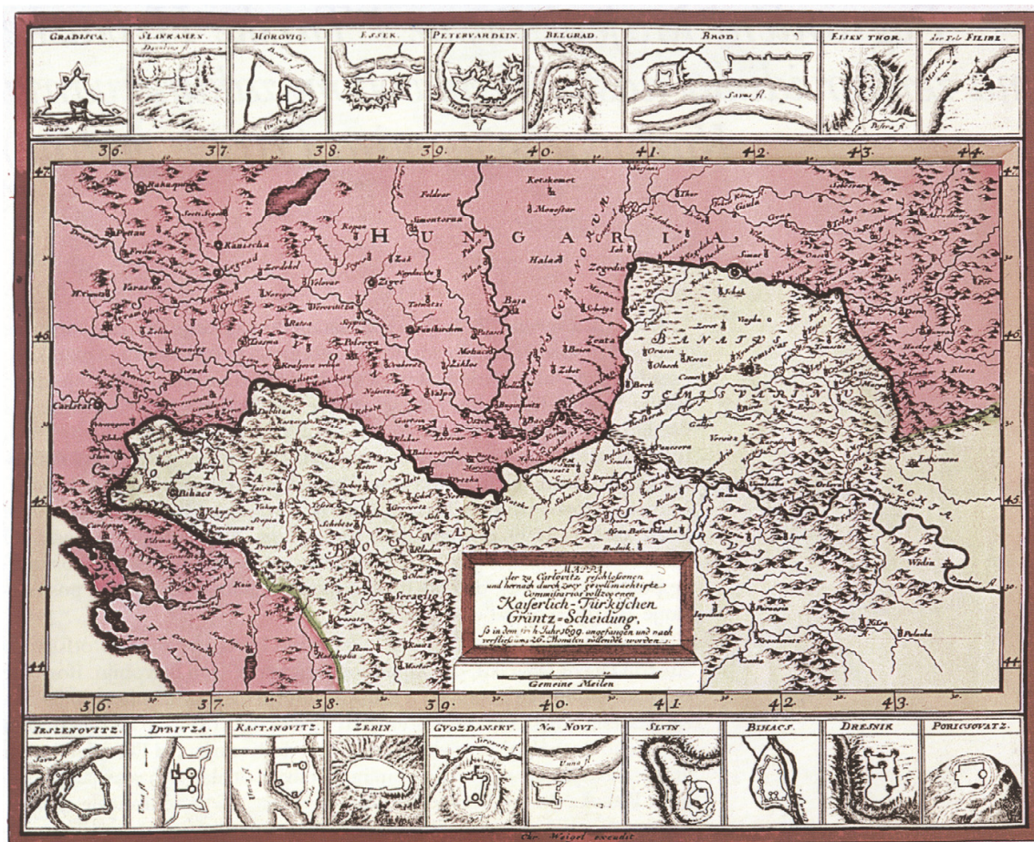
Figure 3. Weigl's Map of the Imperial – Turkish border, 1702; facsimile in [20]

These examples of decorative (Coronelli) and "scientific" cartography (Alberghetti), in spite of differences in a technical sense, have some unifying and constant elements that characterize the Venetian cartography of the borderlands. That is a strong rhetoric of power and control in promotion and giving legitimacy to the territorial occupation.