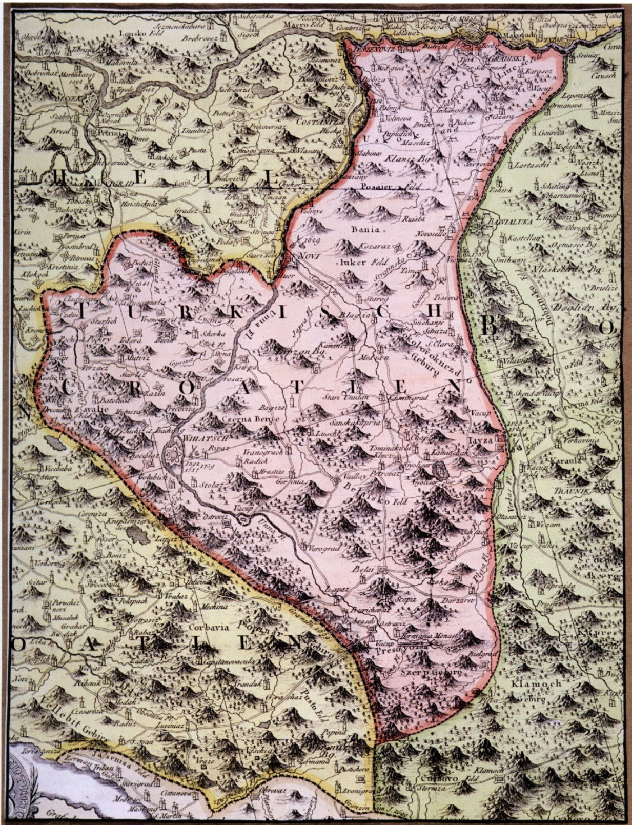
Figure 6. Schimek's map of Turkish Croatia, 1788, facsimile in [20]