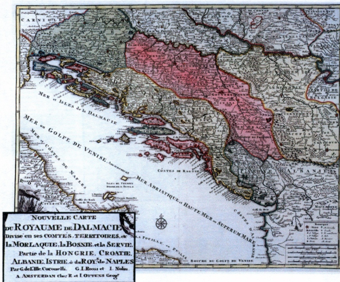
Figure 2. Coronelli's Map of the Kingdom of Dalmatia, La Morlaquie, Bosnia and Serbia ..., 1700, facsimile in [19]. Emphasized by the author.

cartographer, was the most prominent figure in promoting Venetian politics regarding the territorial pretensions on his maps. They were an important instrument for emphasizing the Venetian conquest over the Ottomans. Coronelli's map of Dalmatia is a general regional map on a rather small scale. The map charts Venetian Dalmatia, the territory of the Republic of Dubrovnik, parts of Croatia, Bosnia, Serbia and surrounding lands (Figure 2).