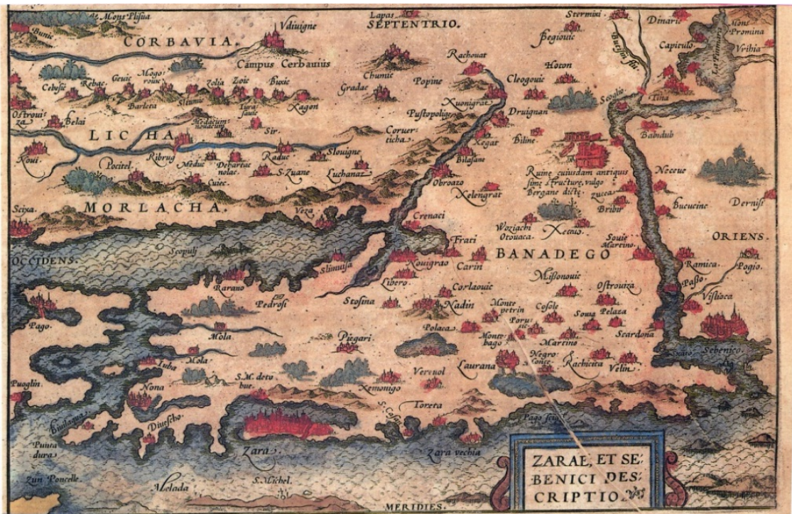
Figure 5. Bonifačić's Map of the surroundings of Zadar and Šibenik with the region of Morlacha, 1573, facsimile in [19]

This change is clearly recognizable in the disappearance of toponyms associated with Morlacchi. Constructed in the multicultural border circumstances of the 16 th – 19 th centuries, they disappear from the maps with the change of circumstances that created them. Following the change in the rhetoric of the maps, we can read about the territorialization as well as about the de-territorialization of borderland communities.