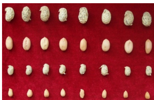
Figure 1. Pods and seeds of mutant type (top 2 rows) and wild type (bottom 2 rows) of A. duranensis

The mutant was identified in a separate square cement block allotted to A. duranensis in the wild peanut nursery at SPRI Experiment Station, Laixi. The plant was grown from a seed of similar size to that of A. duranensis , but was found to possess thicker branches, and larger leaflets, pods and seeds (Figure 1, Table 9). The size and weight of pods and seeds of wild and mutant type A. duranensis significantly differed ( P < 0.01 ).