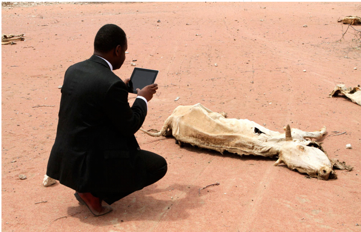
Figure 3. The impacts of climate change like this compel livestock owners to graze their livestock inside the protected areas illegally.

communities. In many protected areas such as Kijereshi and Maswa Game Reserves, these conflicts have culminated into wounding and killing of wildlife staff [48]. Oftentimes pastoralists have coped with droughts by moving with their livestock to other parts of the country where they equally increase pressure in protected areas' exceptional resources and values. For instance, movement of Sukuma pastoralists towards southern Tanzania in 1990s and 2000s had serious ecological impacts in Ihefu and Great Ruaha River, which are key for survival of Ruaha National Park [49]. Experience shows that in many protected areas, illegal activities such as poaching increase when events such as floods destroy the infrastructure and making the parts of the protected areas inaccessible by law enforcement staff (personal experience).