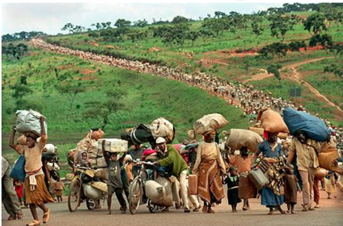
Figure 8. Refugees fleeing civil wars from their countries contribute to population increase and demand for resources at the destinations where they settle.

Along with illegal hunting, refugees had a profound impact on wildlife habitats. Deforestation caused scarcity of fuel resources, land degradation, destruction of water sources and, consequently, encroachment into protected areas. At the peak of the Rwanda refugee crisis, daily consumption of firewood for camps in the Kagera region alone was about 1,200 tons [66]. Generally, an average of 300 metric tons of fuel wood were consumed per day in 1997 [65]. The impacts of deforestation extended up to 20km away from the camps. Destruction or deforestation in BENACO area was estimated at 960 km 2 of land. Aerial photos of the affected region taken in 1996 showed that some 225km 2 and roughly 470km 2 of land were completely and partially deforested, respectively [65].