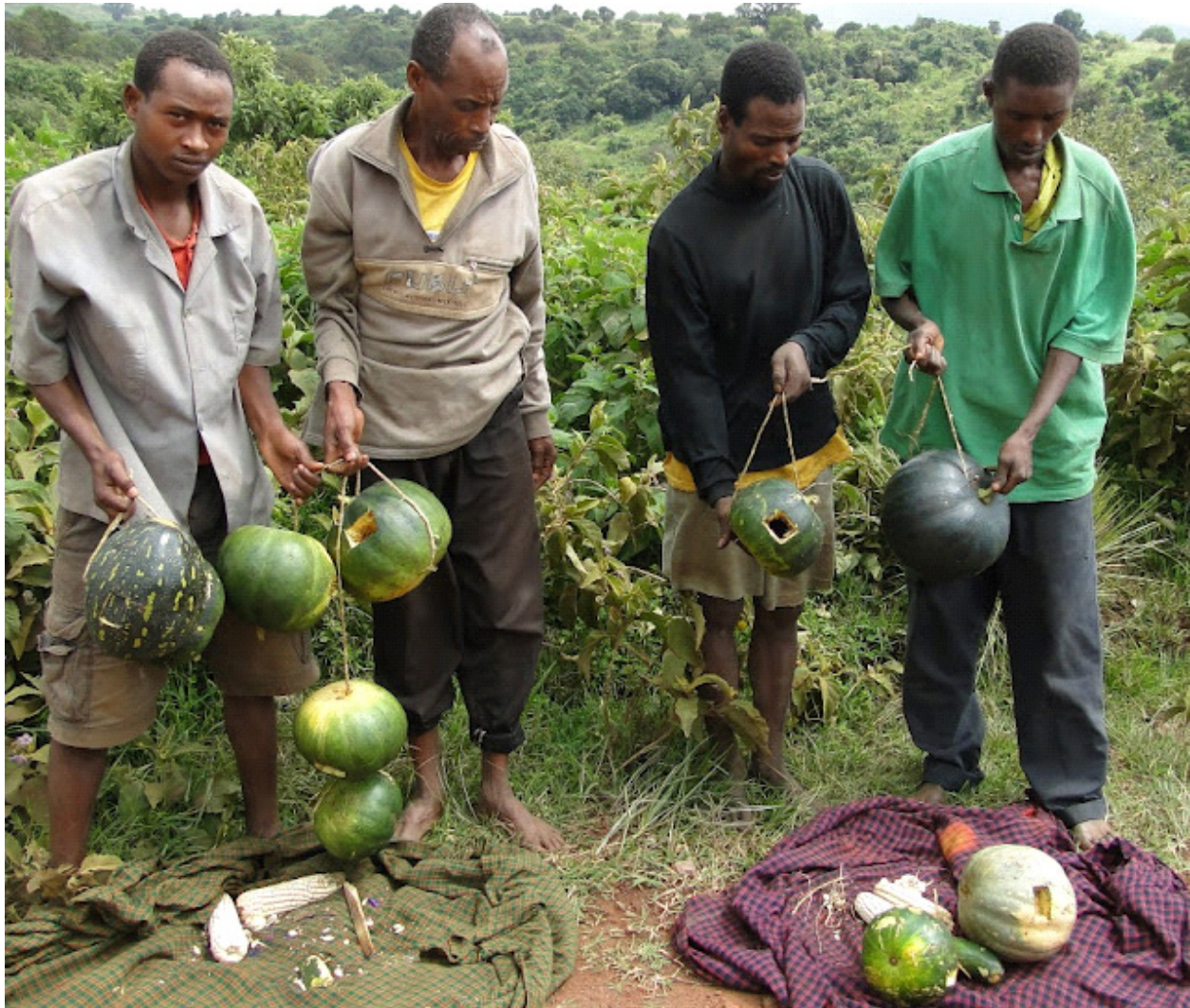
Figure 4. Increased poverty leaves the poor without option other than poaching. Four suspected poachers arrested in Ngorongoro Conservation Area with poisoned watermelons and pumpkins targeted to kill the elephants.