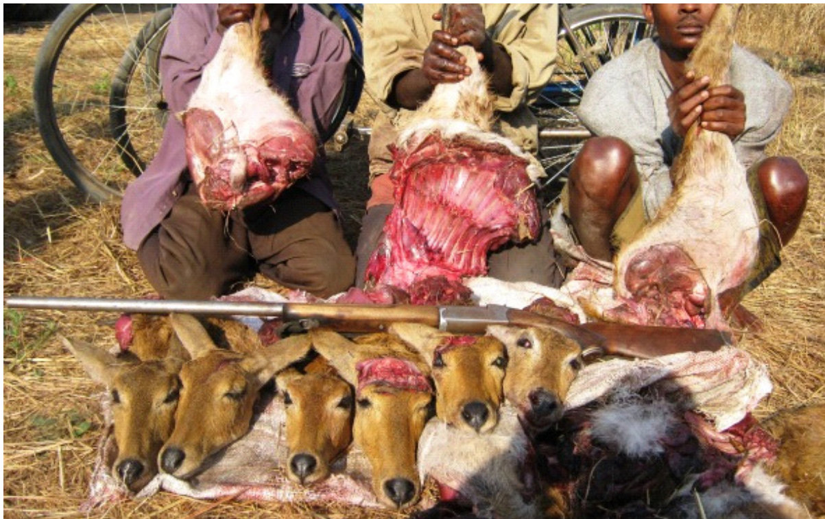
Figure 7. Illegal hunting for bush meat is important coping strategy against poverty

The impacts of refugees were also noted in Gombe National Park. Numbers of several wildlife species including buffalo, zebra, bushbuck, and duiker ( Cephalophus spp.) were reported to have declined notably [69]. Also noted in southern portion of this park was a considerable decrease of the population of chimpanzee ( Pan Troglodyte ) attributed to proximity of the area with large Congolese immigrants, who traditionally eat primate meat [69].