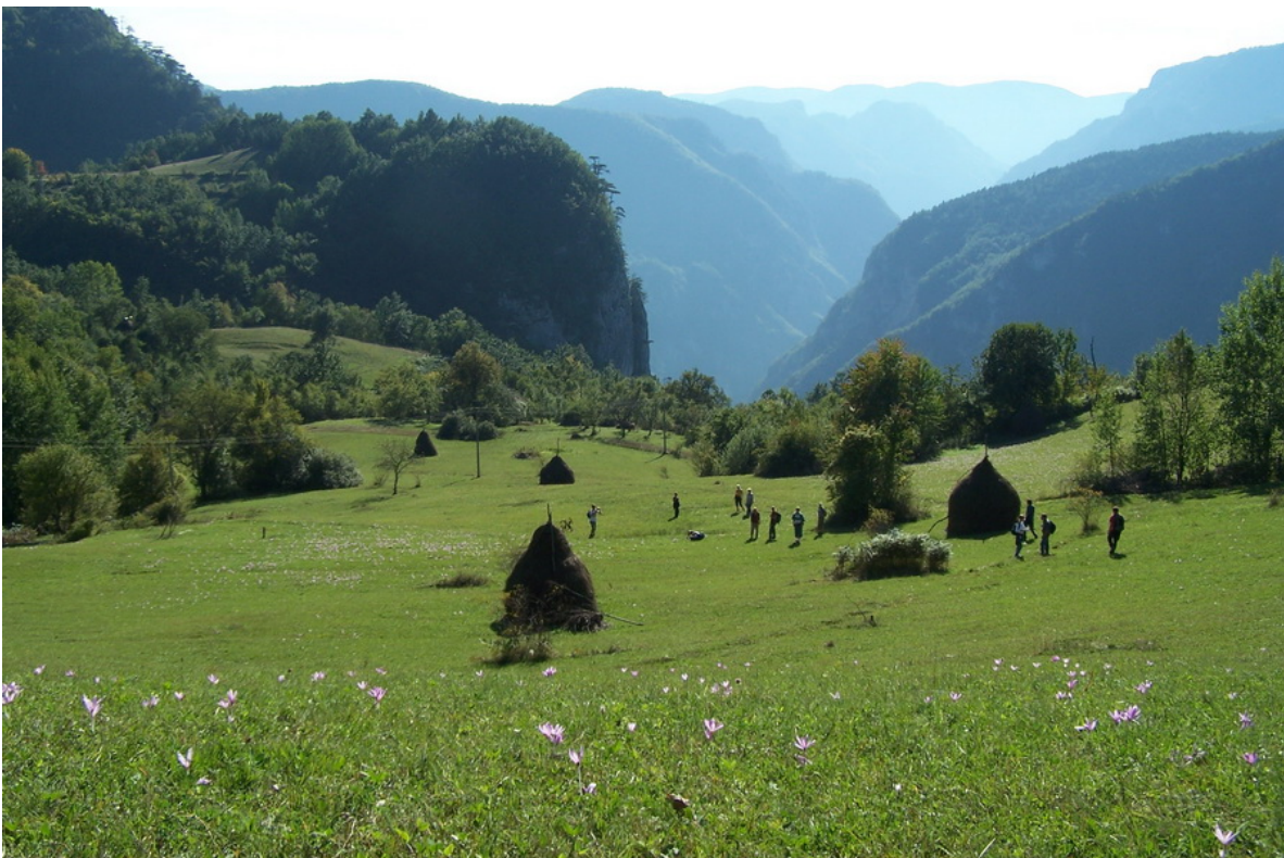
Figure 6. Tourists in Tara NP

The summarized results show that almost a third of the tourists interviewed was for the first time on Tara (30%) while, on the other hand, about a third of the respondents (26.7%), visited NP Tara for more than 4 times. The remaining number of the respondents visited Tara from 2 to 4 times. Among other things, the number of visits to the park has an influence on the creation of positive attitudes towards nature conservation; with an increasing number of visits the intensity of experience in nature also increases which then strengthens the relationship man-nature, or man- the environment and vice versa (Figure 6.).