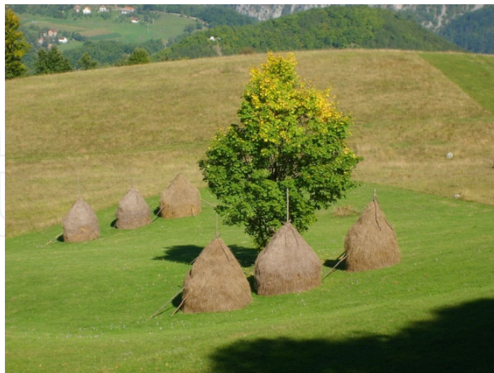
Figure 2. Meadows and pastures in Tara NP

Tara mountain range was formed more than 600 million years ago from Palaeozoic limestone and shales. Glacial and postglacial events played a significant part in determining the flora and fauna of this protected area. During the great ice age and the alternation of