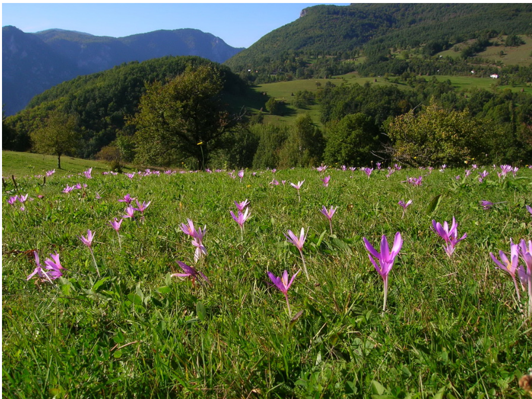
Figure 8. Beautiful scenery in Tara NP

because of which territory got the status of national park, comprehensive understanding of the nature is necessary (Figure 8.) [26].