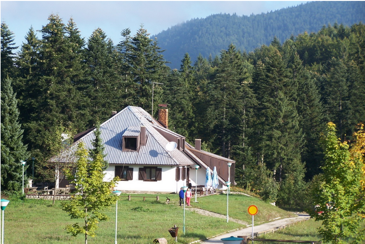
Figure 4. Predov krst – tourist centre in Tara NP