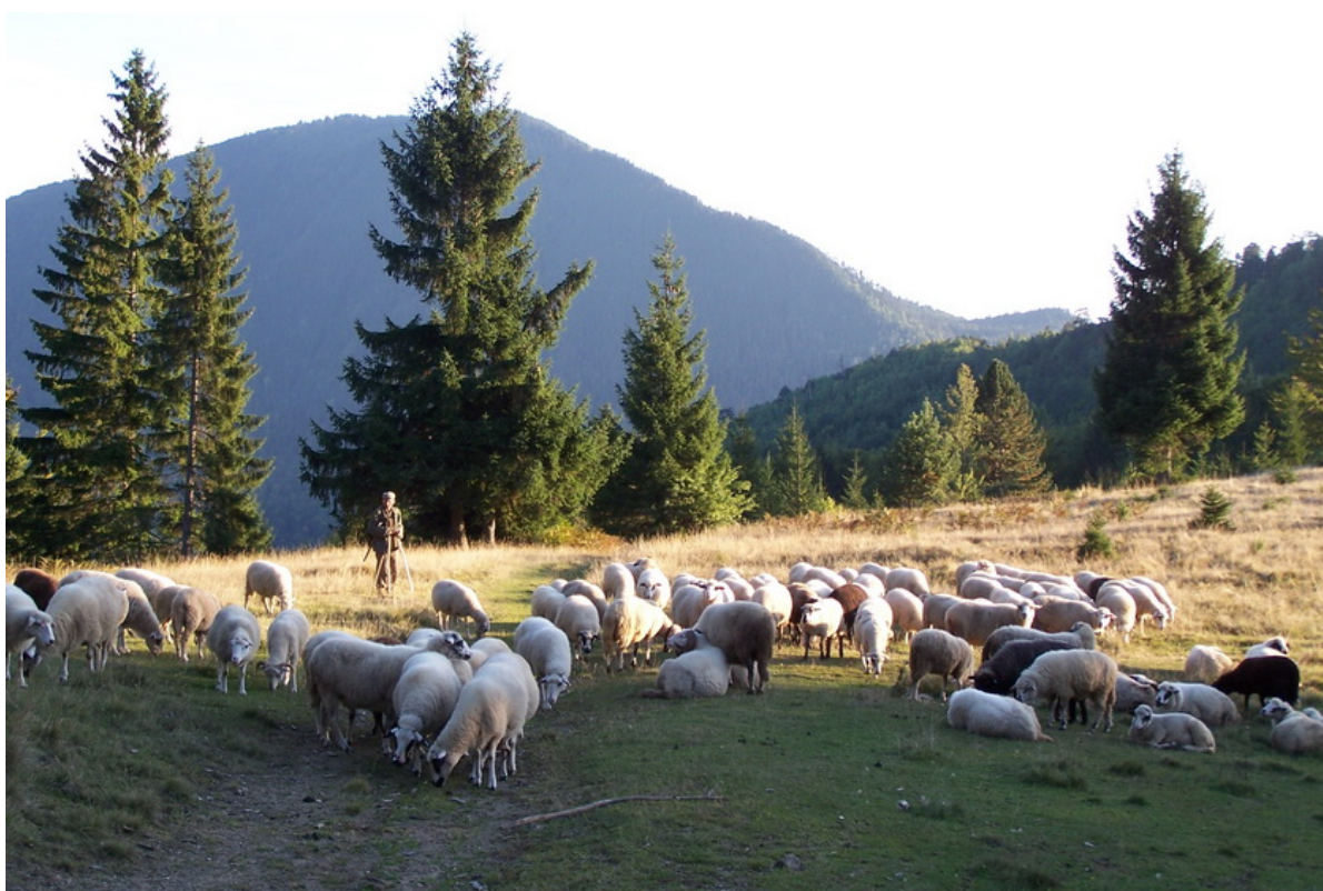
Figure 3. Cattle breeding in Tara NP

In the period 1948-1981, the population of the Tara region decreased to 5000 people, of which 900, or 17.2%, live within the national park. In Jagoštica village there are 53 households and 163 inhabitants. Rastište village has 107 households and 285 inhabitants. There are eight villages along the borders of the national park. Parts of the associated households and their estates are located within the national park, including mainly forests, but also meadows and pastures. The main occupations of the inhabitants of this region are agriculture and forestry (Figure 3.). A small number of inhabitants of the region are employed, mainly in forestry. The possibility of employment in other activities is limited, leading to a population drain, which along with a low birth rate means that the population is in decline. The dwindling population is a consequence of the underdevelopment of the region and the difficult local employment situation, causing the inhabitants to migrate to more developed areas [13,14].