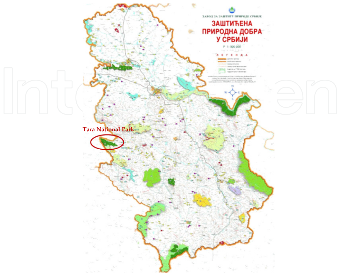
Figure 1. Map of natural protected areas in the Republic of Serbia, with the geographic position of Tara National Park