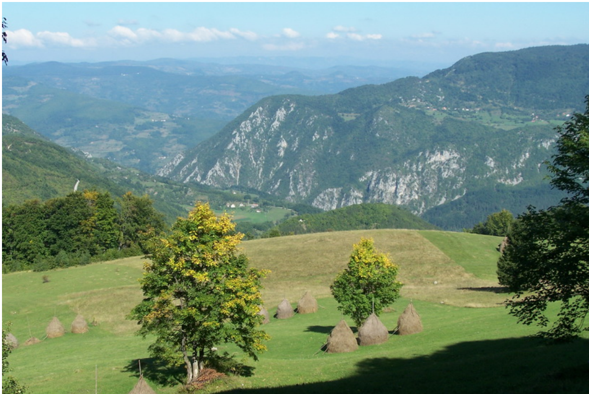
Figure 5. Landscape in Tara NP

Further on, when tourists were asked to answer why Mountain Tara was declared a national park, the obtained answers point out the fact that it is because of: 'untouched nature', 'beautiful scenery', 'preserved nature', 'rare and endangered plant and animal species', many of which mentioned Pančić's Spruce, 'rich wildlife', 'lakes' and 'forest' (Figure 5).