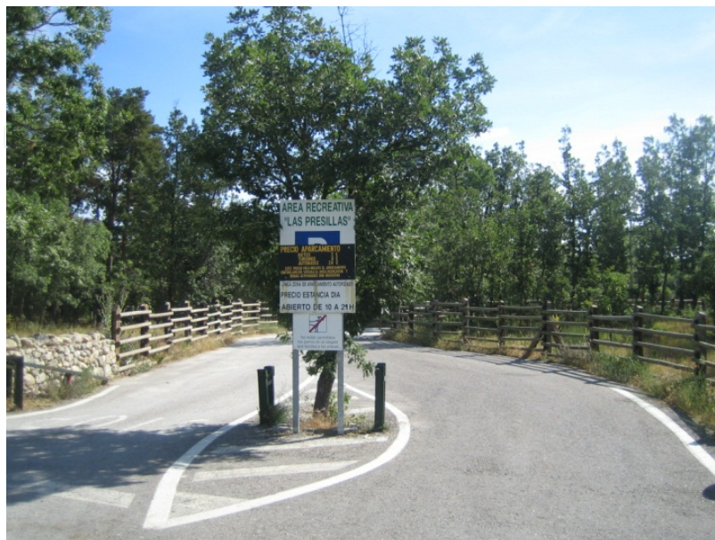
Figure 3. Parking fee in Peñalara Natural Park, Madrid Region, Spain

Well-thought decisions should also be taken about visitors being charged repeatedly during their visits (for instance, for car parking, access to the PA, and / or visitation of public use infrastructure), and about the appropriate quantities to be charged in view of recovery costs, so no additional charges are imposed to the PA administration (Chape et al., 2008).