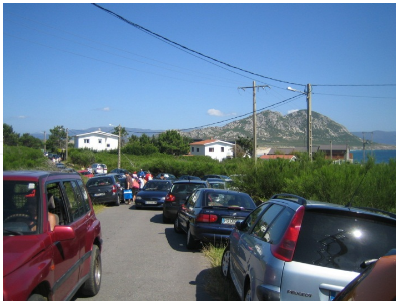
Figure 2. Visitors may be an intense pressure in protected areas

Tourism is an extremely delicate issue regarding PA management. Whereas often seen and promoted as social and economic salvation for local communities, if unregulated it may, on the one hand, lead to the deterioration or destruction of the resources of the PA and, on the other, threaten local culture. If well planned and managed, however, tourism can provide a significant source of revenue for local populations and / or PA administrators, as well as increase visitor education and environmental awareness (Chape et al., 2008).