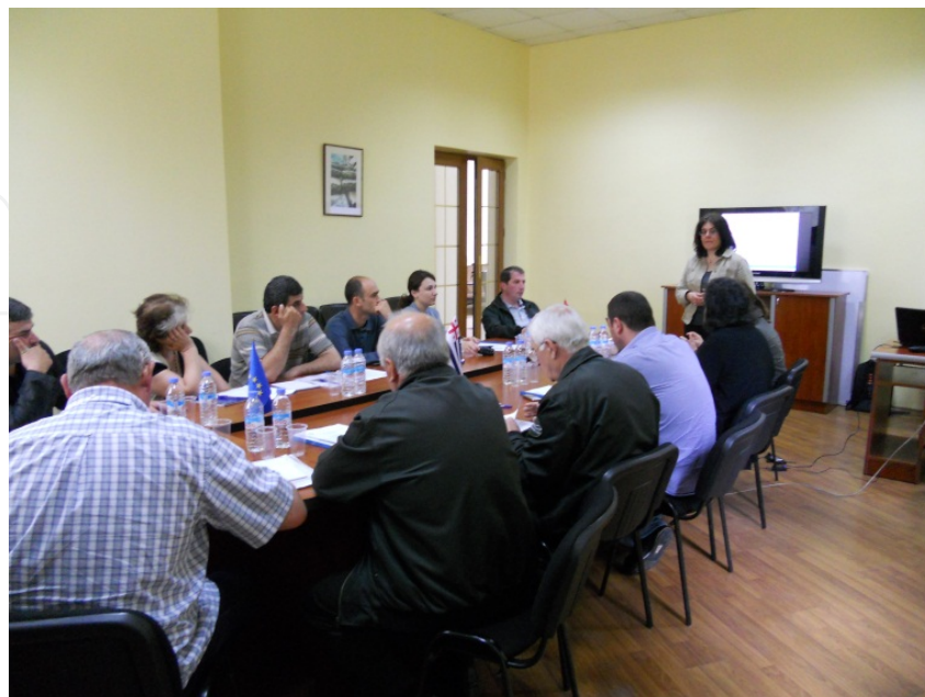
Figure 5. Presentations and workshops are useful training options

However, knowledge-transfer should not be unidirectional, from scientists to managers. The publication or communication of empirical management result and practices, be they successful or a failure, is also very important for advancing towards a more effective management of PAs and can provide science with interesting new research topics and experiences.