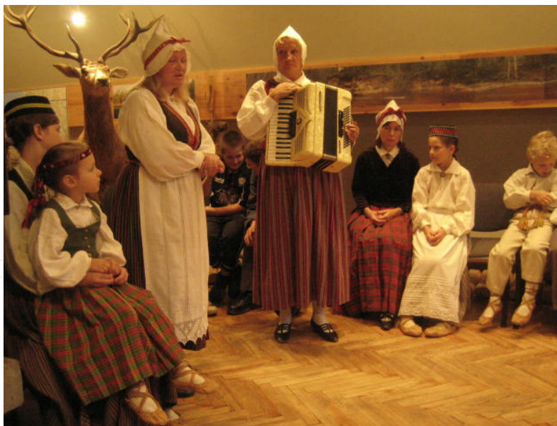
Figure 1. Cultural features and traditions are an important and often neglected asset of protected areas

Acknowledging the role of man within nature and its importance for the conservation of many species, habitats and ecological processes, especially in Europe where cultural landscapes are paramount (Jongman, 2002), multiple use of PAs sometimes becomes a "dogma" for PA planners, managers and policy-makers, irrespective of very different conditions and situations. Most conservation policies try to force sustainable development to happen, often through the zoning of PAs (Naughton-Treves et al. , 2005; UNESCO, 2002) or the placing of tourist infrastructures (Farrell & Marion, 2001), regardless of the fact that some activities may conflict with conservational ends. Such conflicts are frequent in densely populated areas between conservation and recreation activities (Tisdell, 2001).