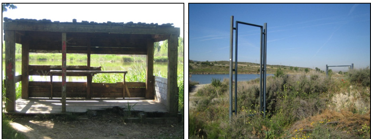
Figure 7. Fauna observation installation in Sureste Regional Park (left figure) and information panels at the entrance of El Regajal-Mar de Ontígola Nature Reserve (right figure). Poor management and inadequate visitor behaviour result in the deterioration of PAs and their infrastructure