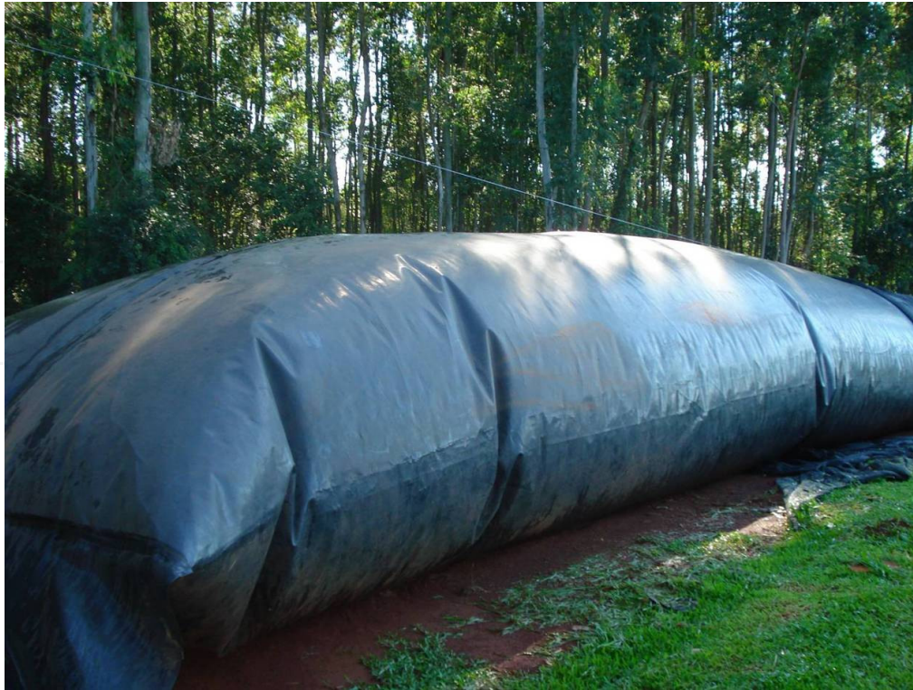
Figure 2. Biogas storage balloon