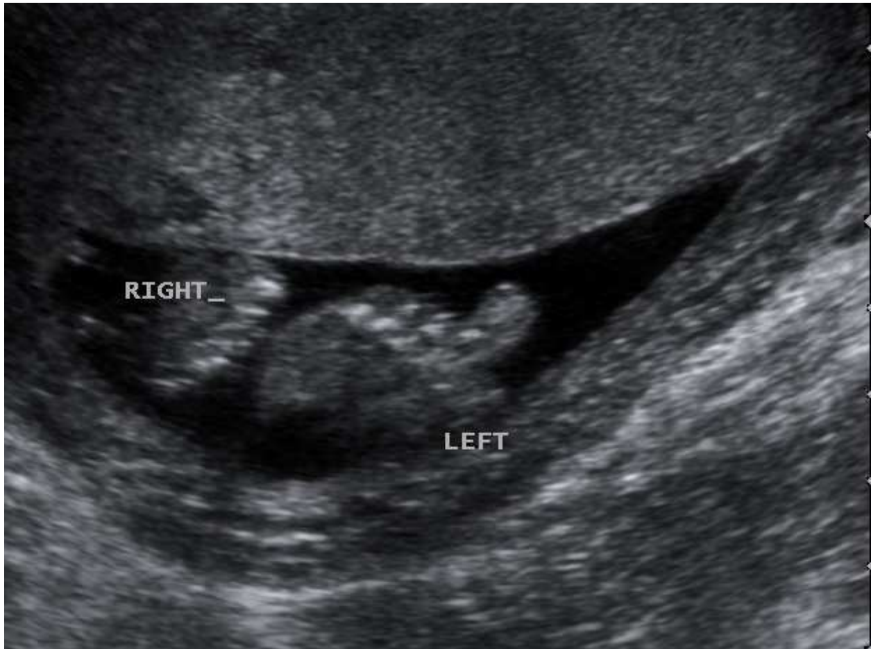
Fig. 1. Ultrasonographic scan of the fetus at 24 gestational weeks demonstrating the difference in size between two second toes. Macrodactyly of the left second toe is confirmed by comparable measurements. This is another image of the same case presented in 'Prenatal diagnosis of isolated macrodactyly' in Ultrasound in Obstetrics and Gynecology 2009; 33: 360-362.