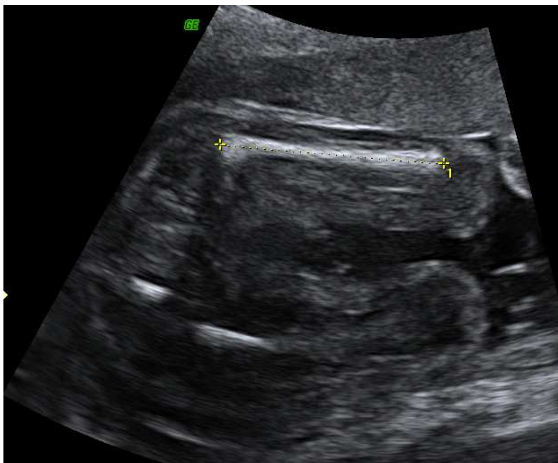
Fig. 1. The scan showing the correct FL measurement

Femur length (FL) is the measurement between the distal and proximal ossification centers of the femoral diaphysis. FL is one of the fetal biometry measurements which is measured ordinarily during the routine second trimester scanning and onwards in determining the gestational age and growth between ultrasound examinations.