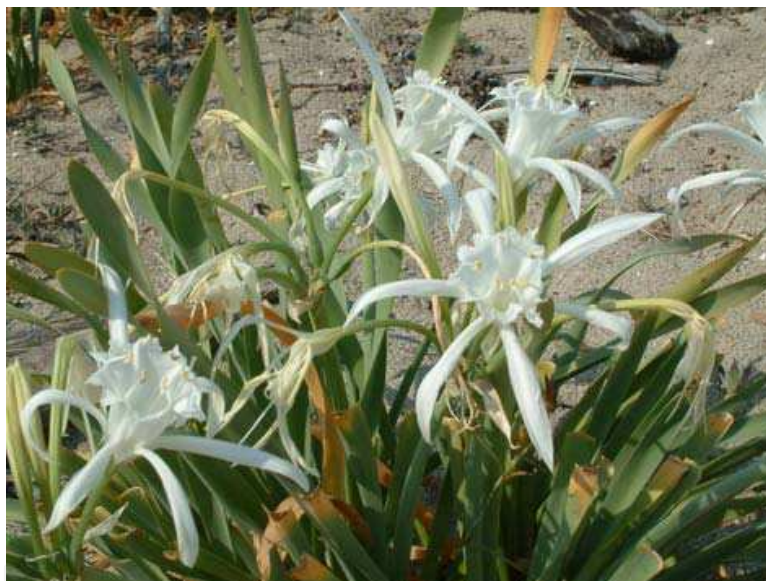
Fig. 10. Pancratium maritimum .

There are three longos forests in the area. The conserved natural longos forests in the study area are the Lake Mert longos (316 ha), Lake Erikli longos (456 ha), and Lake Saka longos (624 ha) forests (Figure 11-13) This type of ecosystem is unique and rare in Turkey and the world because these ecosystems are sensitive to environmental conditions. In general, deciduous mixed forest vegetation is found in the area outside of the longos forests, and in this area the forests have similar floristic composition to the longos forests. However, slopes are rather steep in the area where these forests are found, and therefore the water table is well below the surface. The different ecosystems in the area provide a diverse living environment for the fauna in the region. Nearly half (194) of the 454 bird species constituting the bird diversity of Turkey are seen in this area during the year (Özyavuz and Yazgan, 2010).