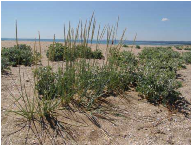
Fig. 8. Leymus racemosus .