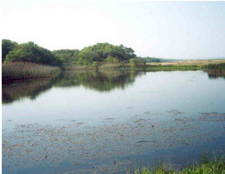
Fig. 13. Lake Saka.