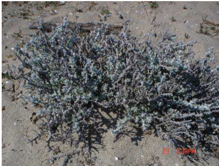
Fig. 9. Otanthus maritimus .