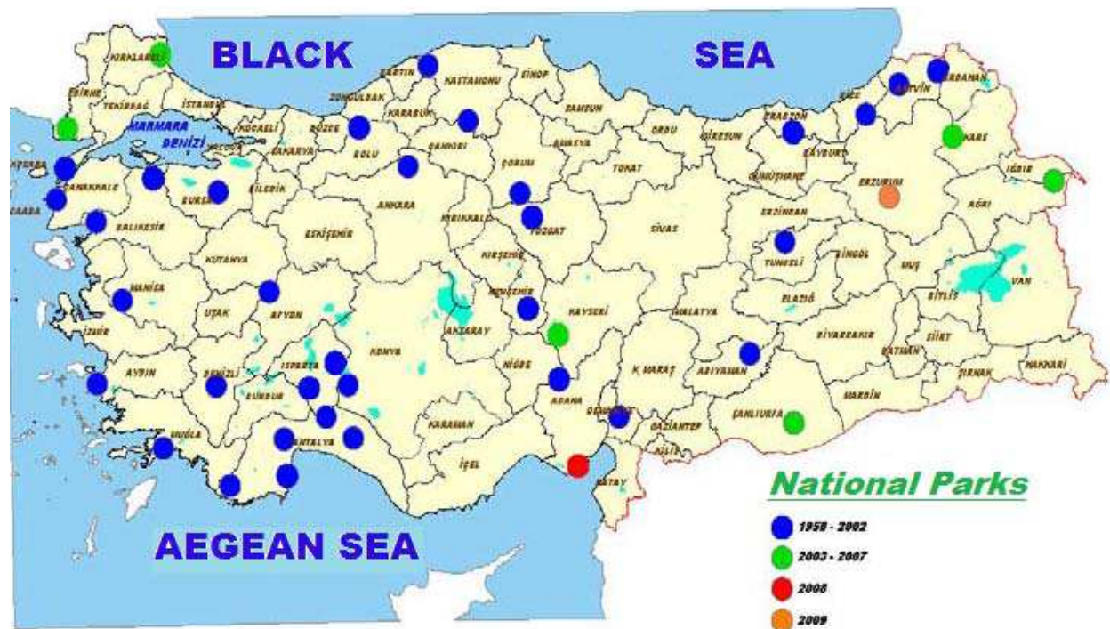
Fig. 2. National parks in Turkey.

The first national park in Turkey was established in 1958 ( The Yozgat Pine Grove National Park ) (Figure 3). Some of these parks, which were initially established for archaeological and historical purposes, are at the same time rich habitats where biological diversity is being protected.