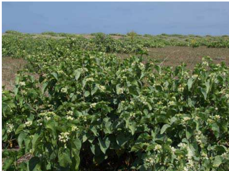
Fig. 5. Cionura erecta .

There are five lakes in the area. Lake Erikli Lagoon (43 ha) is adjacent to the northern part of Igneada subdistrict, which is not linked with the sea during the summer period. Lake Mert (266 ha) is located at the southern part of the subdistrict, where the stream reaches the Black Sea. Lake Saka, which is the smallest (5 ha), is at the southernmost part of the study area between the forest and sand. Lake Hamam (19 ha) and Lake Pedina (10 ha) are located in the inner part. The coastal dunes and the longos forests of Igneada constitute the most sensitive ecosystem in the study area. Most of the known endemic plants ( Silene sangaria , Crepis macropus , Centaurea kilaea ) in Igneada and its vicinity are found in the coastal dunes; other species found here, though not endemics, are of national and international concern ( Aurinia uechtritziana , Cakile maritima , Cionura erecta , Crambe maritima , Cyperus capitatus , Elymus elongatus subsp. elongatu , Eryngium maritimum , Euphorbia peplis , Eu. paralias , Jurinea kilae , Leymus racemosus , Otanthus maritimus , Pancratium maritimum , Peucedanum obtusifolium , Stachys maritima ) (Figure 5-10) (Özyavuz and Yazgan, 2010).