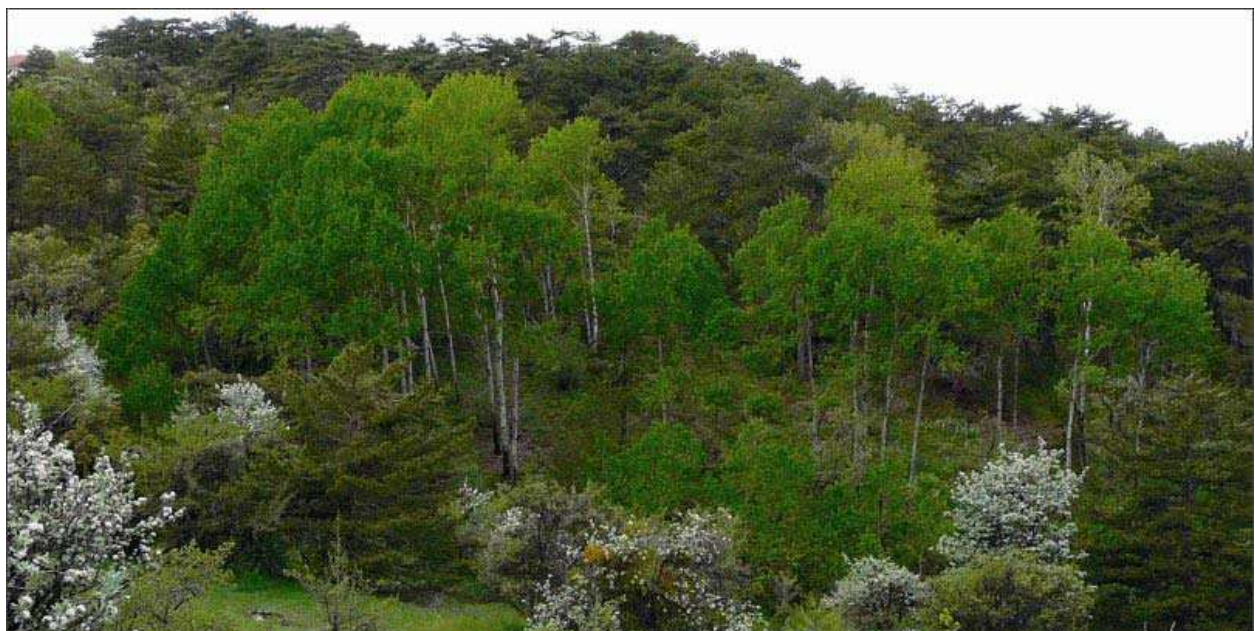
Fig. 3. The Yozgat Pine Grove National Park, Turkey ( www.milliparklar.gov.tr ).

The first national park in Turkey was established in 1958 ( The Yozgat Pine Grove National Park ) (Figure 3). Some of these parks, which were initially established for archaeological and historical purposes, are at the same time rich habitats where biological diversity is being protected.