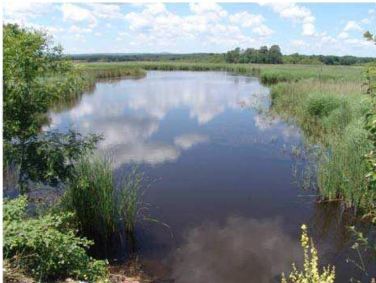
Fig. 12. Lake Erikli.