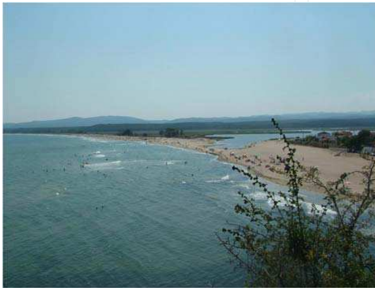
Fig. 4. General view of this area.

The İğneada Longos Forests National Park, located on the Black Sea coast 15 km from the Turkish-Bulgarian border, is positioned between the northern latitudes 41° 44' 43" and 41° 58' 27" and the eastern longitudes 27° 44' 52" and 28° 3' 17". The İğneada area includes different kinds of ecosystems (sand dunes, wetlands, longos (flooded alluvial) forests, deciduous forests, and many streams) and a wide range of biodiversity; these characteristics make it one of the most important areas in Turkey (Ozyavuz, et al., 2006) (Table. İğneada and the surrounding environment have unique characteristics; these types (İğneada Longos Forests) of wild forest in other parts of Turkey and in Europe have been damaged due to anthropogenic effects (Figure 4).