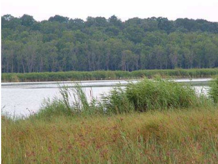
Fig. 11. Lake Mert.