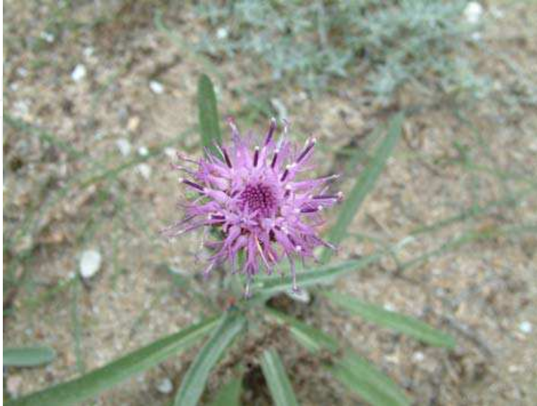
Fig. 7. Jurinea kilae .