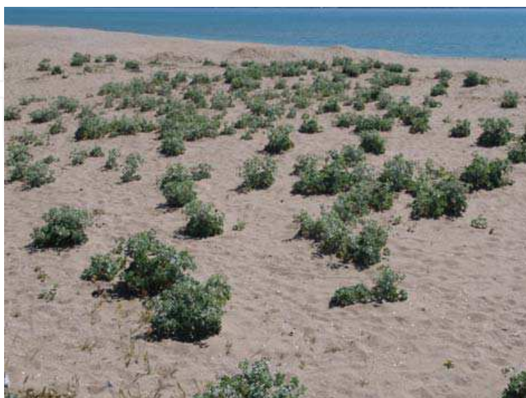
Fig. 6. Eryngium maritimum .