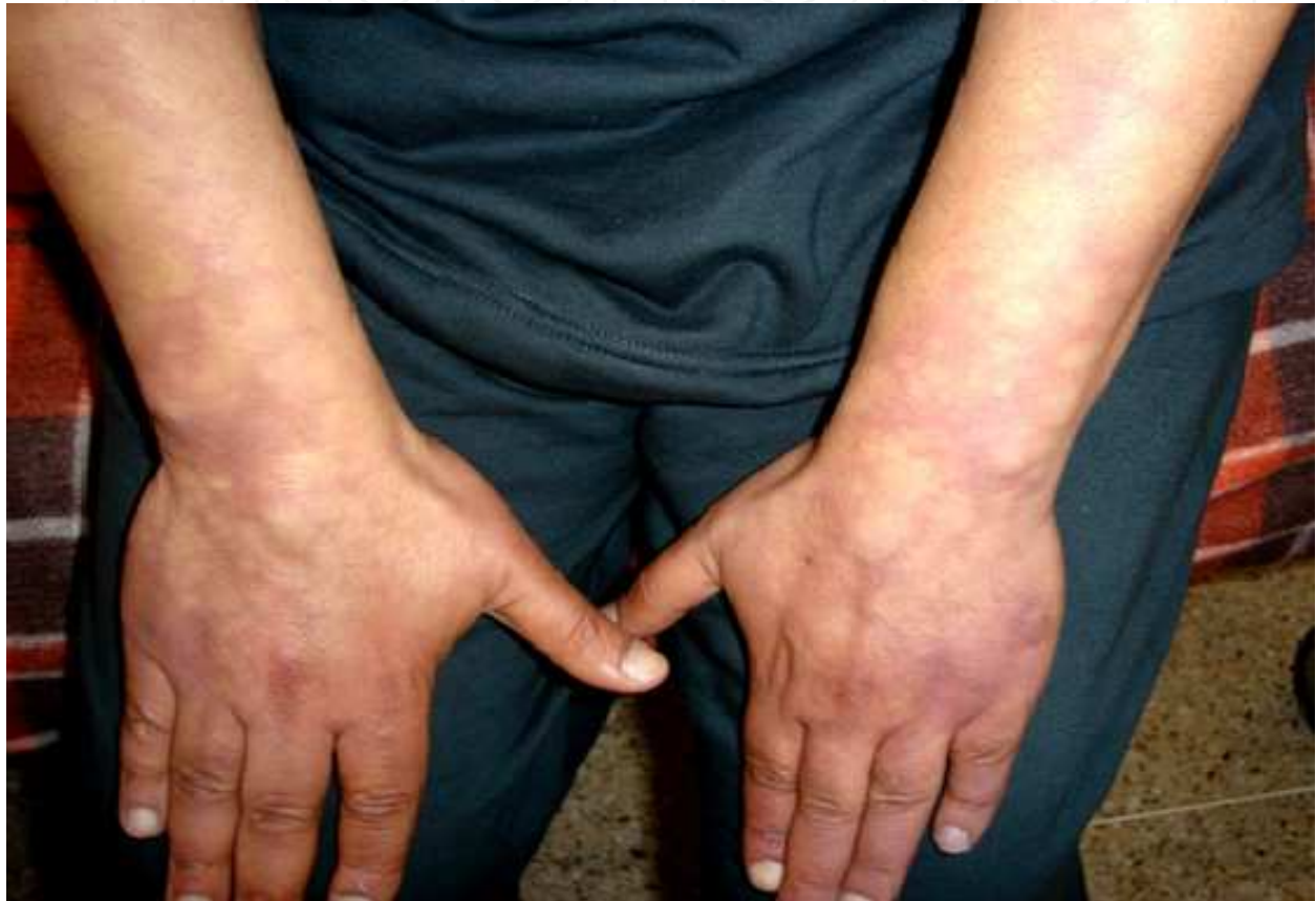
Fig. 1. Livedo racemosa affecting upper limbs in a patient with Sneddon's syndrome (personal figure)

In conclusion, seronegative Sneddon's syndrome should be distinguished from Sneddon's syndrome with aPL which should be considered as a subgroup of APS. Cognitive disorders in both Sneddon's syndrome and APS seem to be similar affecting mainly memory, attention and concentration functions. They represent sometimes the inaugural symptom in a patient without any history of known ischemic stroke. Recurrent stroke may lead to multi-infarct dementia and early retirement in young people. Prognosis depends on early diagnosis. More subtle cognitive dysfunction can be shown. These troubles are related to posterior cortical infarcts or to leucoencephalopathy. Treatment should be aggressive in case of cognitive disturbances in Sneddon's syndrome or APS.