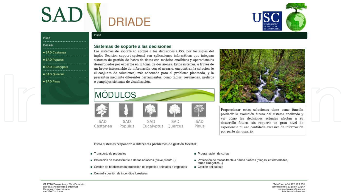
Fig. 2. SaDDriade initial screen.