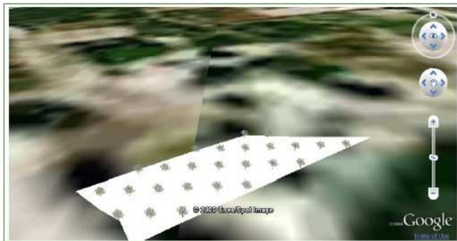
Fig. 5. Location of trees in a parcel and selected model.

parcel or just a section, where the user can fly virtually into the trees, “walk” between them or make visualizations within a wider context.