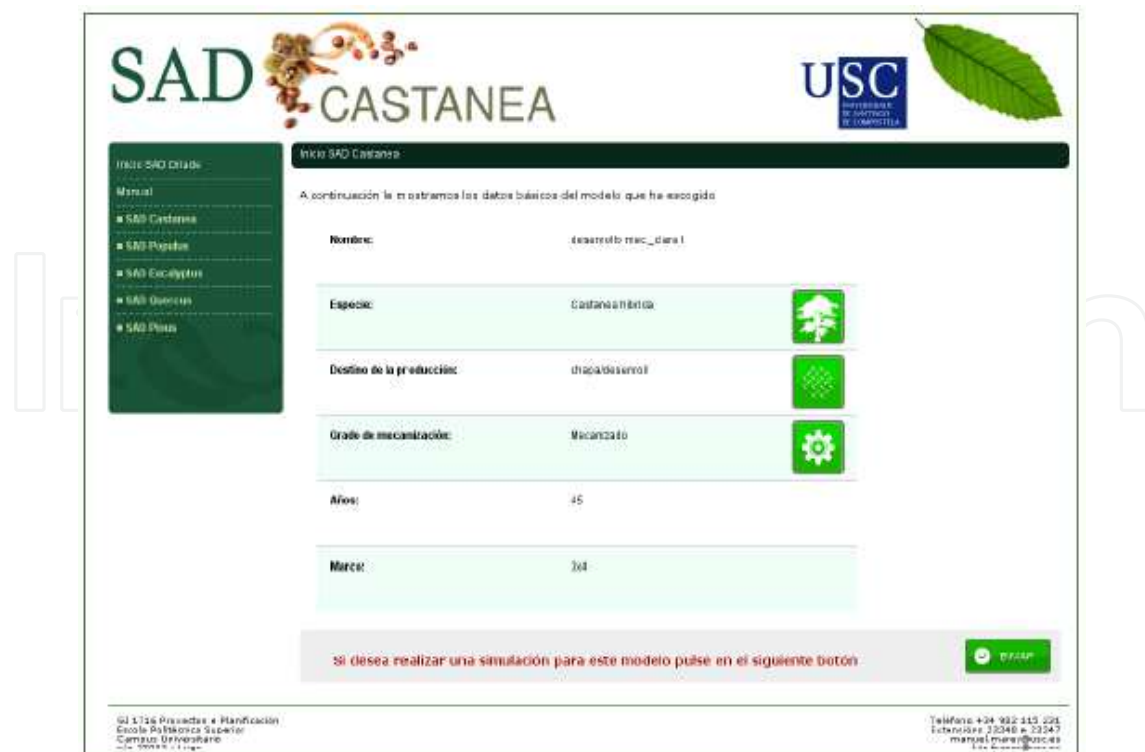
Fig. 3. Characteristics of a selected model.

After the basic characteristics of the model are presented, some parameters that influence the task development and performance of the chosen model are shown: Characteristics of the place: slope, percentage of rocks, stone content, soil type; Initial state of vegetation: type, height, density and presence of stumps; Management alternatives: choice between base-root