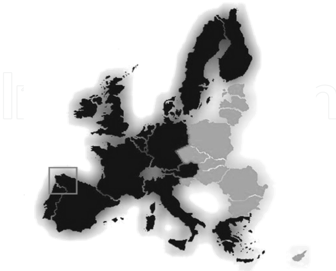
Fig. 1. Location of Galicia in Europe and Spain

regarding these types of activities. These initiatives are going to depend on the DSS problem-solving capacity.