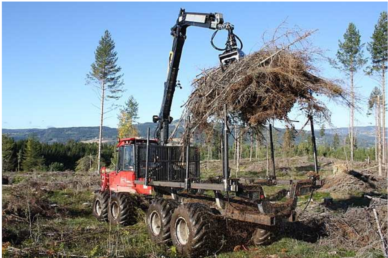
Fig. 2. Removal of a pile of branches and tops six months after harvesting, Gaupen, Norway

There is some concern that piling of branches and tops might increase the risk for pest outbreaks, in contrast to direct removal of these residues after harvesting or chipping on-site. However, compared to SOH, piling, if carried out before insect colonisation, might even reduce the risk for outbreaks because larger amounts of wood (on the insides of the piles)