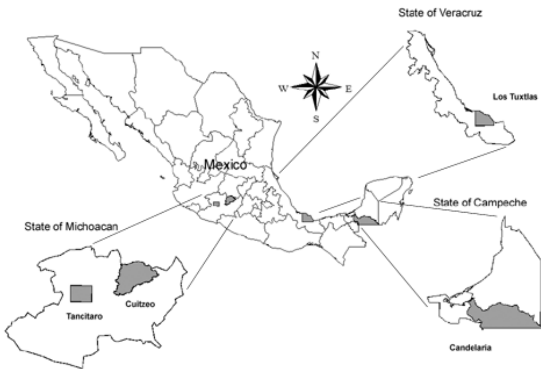
Fig. 2. Location (shaded in grey) of the four eco-geographical areas in Mexico.