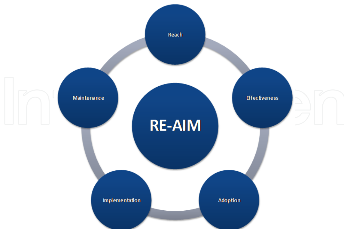
Fig. 1. The RE-AIM Framework

To be effective and meet predetermined expectations, the CDSMP national roll-out necessitated a broad public health perspective. In consultation with translational researchers, AoA administrators drew upon the RE-AIM framework as an organizing framework for program planning and evaluation (Glasgow, et al., 2001; Glasgow, et al., 1999). As part of funding requirements, AoA grantees were expected to describe their use of the RE-AIM model to plan, implement, evaluate, and sustain their proposed health promotion programming.