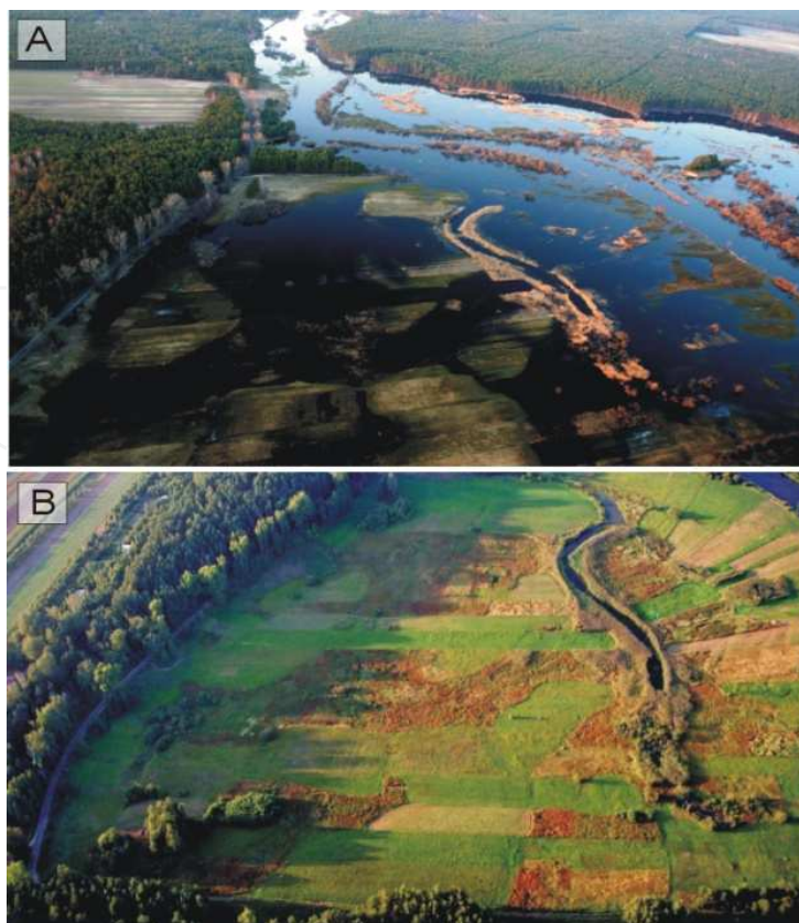
Fig. 1. The Pilica River floodplain, upstream of the Sulejów Reservoir (central Poland); A – situation of high discharge ( Q=83.2 \text{ m}^3 \text{ s}^{-1} ) in spring 2006; B - low discharge ( Q= 6.7 \text{ m}^3 \text{ s}^{-1} ) in summer 2006.