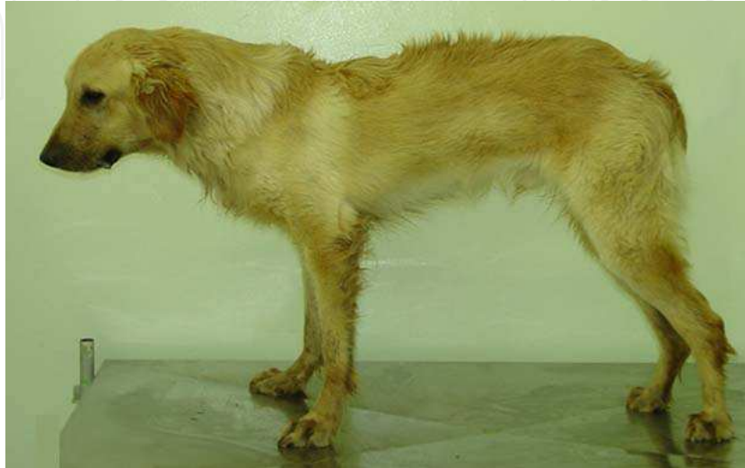
Fig. 1. Golden Retriever muscular dystrophy dog (GRMD model). (Ambrosio et al. 2009)

miniature (Paola et al., 1993), Weimaraner (Baltzer et al., 2007), and Boston Terrier (Deitz et al., 2008). GRMD dogs closely resemble DMD patients in terms of both body weight and in the pathological expression of the disease (Collins & Morgan, 2003). However, their phenotype is variable (Banks & Chamberlain, 2008), as some pups survive only for a few days, while others are ambulant for months or even years (Ambrosio et al., 2008). Animal trials employing these dogs have substantial animal welfare implications and high costs associated with both maintenance and treatment (Nakamura & Takeda, 2011).