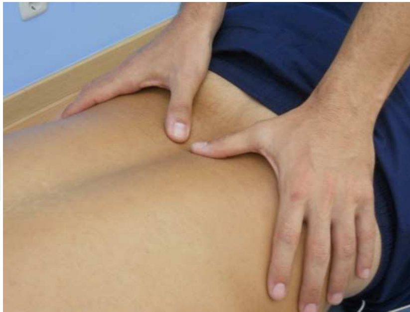
Fig. 12. Activation of multifidus in prone position.