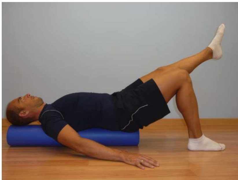
Fig. 30. Supine-lying leg lift.

Supine-lying leg lift. Goal: to develop back stability in an unstable lying position.