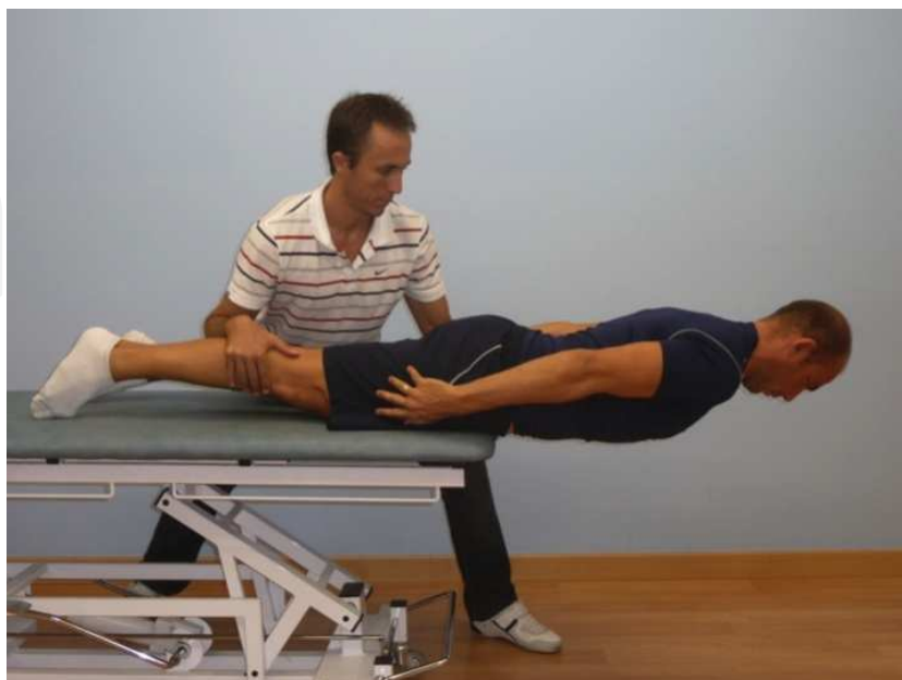
Fig. 7. Sorensen test.

Goal: to determine isometric endurance of trunk extensor muscles.