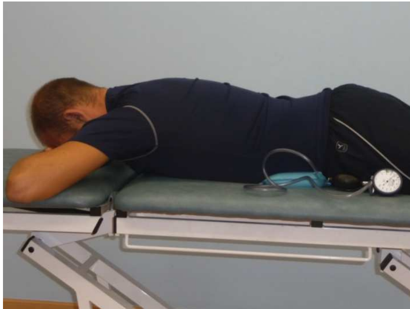
Fig. 8. Prone abdominal hollowing test using pressure biofeedback.

With the patient lying prone, a pressure biofeedback unit is placed under his/her abdomen with the upper edge of the device's bladder below his navel. The unit is then inflated to 70 mmHg and patient is instructed to perform the abdominal hollowing maneuver. The aim is to reduce the pressure reading on the biofeedback unit by 6 to 10 mmHg and to maintain this contraction for 10 repetitions of 10 sec. each while breathing normally.