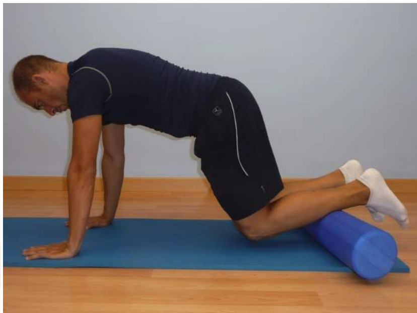
Fig. 32. Prone tuck on roller.