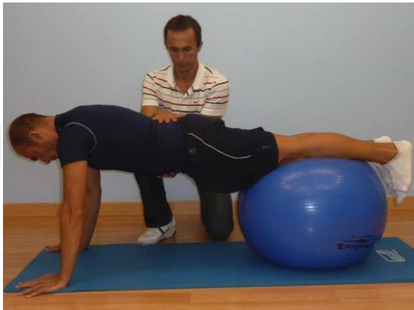
Fig. 29. Bridge with therapist pressure.