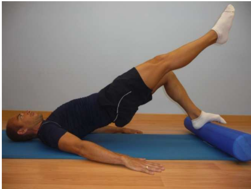
Fig. 31. Bridge with heel raise on roller.