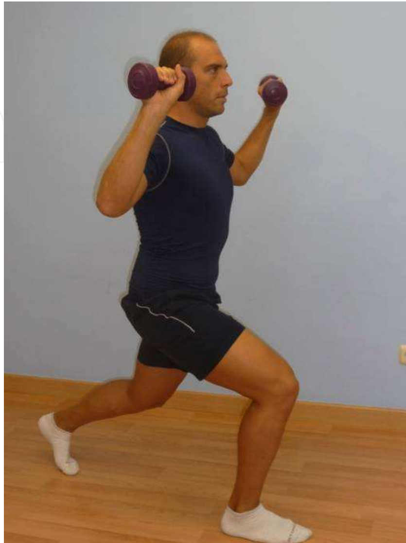
Fig. 18. Closed chain lunge exercises, with the addition of hand weights.