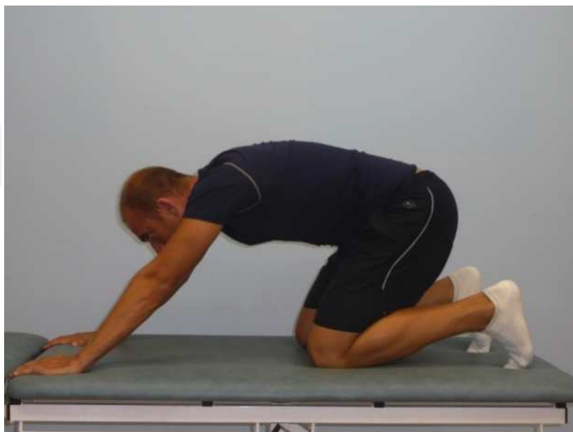
Fig. 9(b). Kneeling rock-back; ended position.