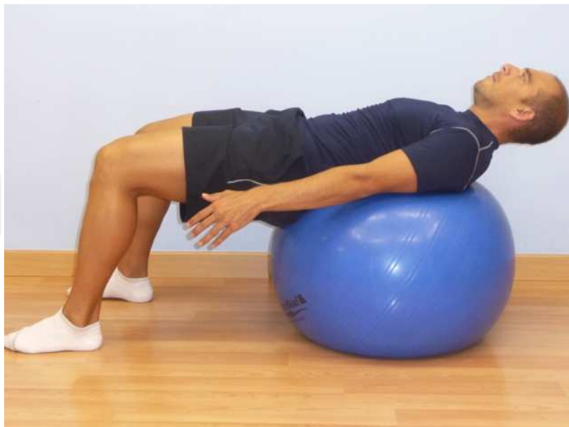
Fig. 27. Lying trunk curl with leg lift.