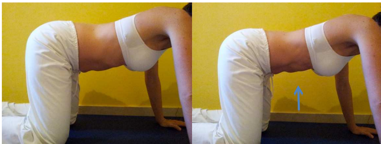
Fig. 15. Abdominal hollowing: activation of transversus abdominis in four point kneeling.