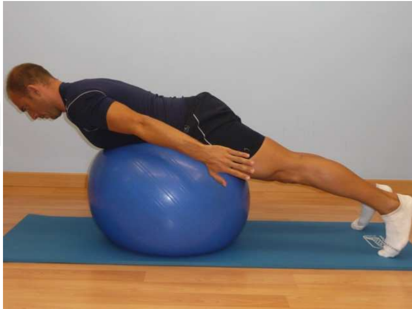
Fig. 28. Basic superman.