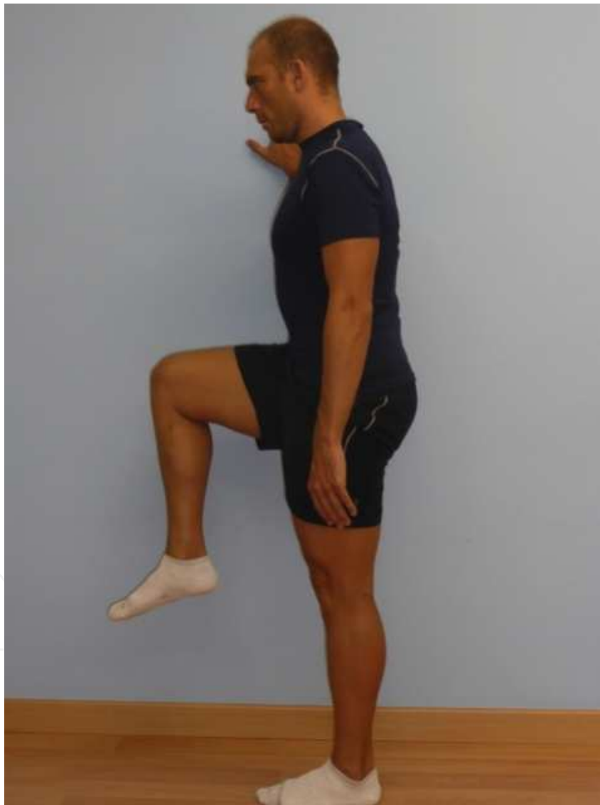
Fig. 10. One-leg lift.

Patient stands side-on to a wall with one hand on the wall for balance if needed. He/she is instructed to slowly lift one leg, with the knee bent. The leg should reach a comfortable position -usually above hip height- and then lower. The examiner monitors the lumbar-pelvic region from the front and the side. In optimal alignment, the pelvis should remain level horizontally as the patient lifts his leg, and the sequence should be hip motion (flexion) followed by pelvic motion (posterior tilt) followed by lumbar motion -lordosis flattens and then reverses-. Poor control exists when the pelvis drops as the leg is lifted, and the lumbar spine flexes during the early stages of the movement.