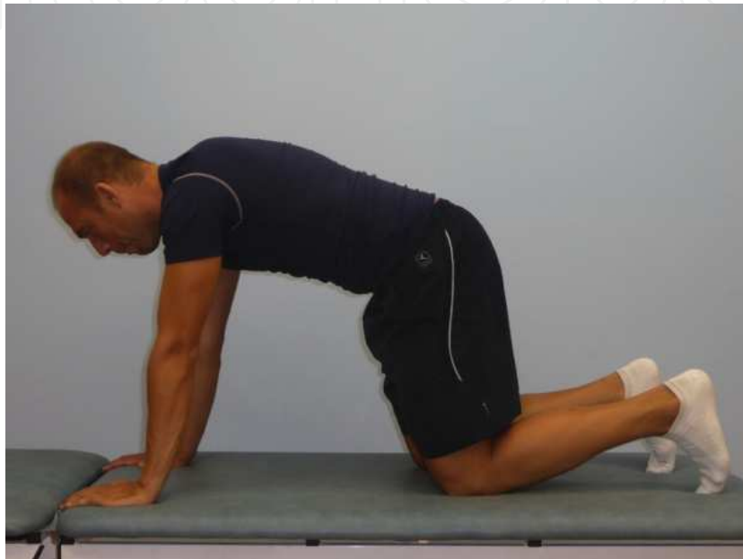
Fig. 9(a). Kneeling rock-back; starting position.

Patient is kneeling on a mat on all fours, with his/her hand directly beneath his shoulder and his knee beneath his hip. The test begins with the lumbar spine in a neutral position and then is rocked backward, pulling the hip behind the knees. Examiner should monitor the pelvic tilt angle and lumbar lordosis. Motion should begin at the hip for an optimal segmental control. Once hip flexion passes about 120^\circ (depending on patient's body proportions), his pelvis should posteriorly tilt and his lumbar spine flatten. Examiner should ensure that he moves slowly, and determine whether the sequence is motion at the hip-pelvis-lumbar spine. Poor segmental control will be present if the pelvic tilts and the lumbar spine flattens at the beginning of the rock-back.