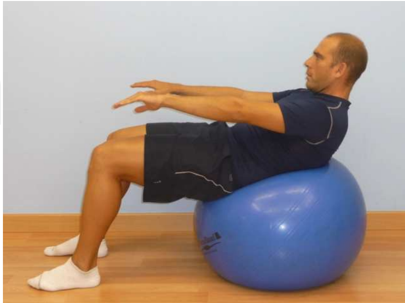
Fig. 26. Abdominal slide.