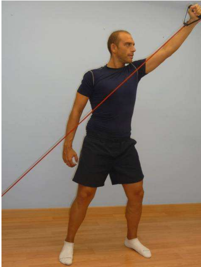
Fig. 24. Open chain exercise of upper limb after co-contraction of transversus abdominis and multifidus.