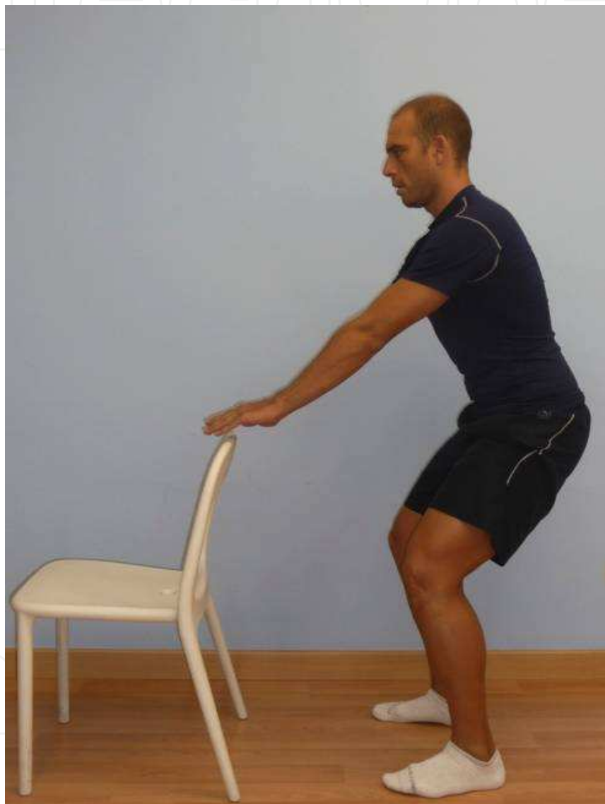
Fig. 11. Forward bending test.

Patient stands with his/her feet shoulder-width apart, facing the seat of a chair. He/she is instructed to bend forward, to touch the chair seat, and to stand back up again. Optimal control occurs when the patient unlocks his/her knees and anteriorly tilts his pelvis, flexing only slightly at the lumbar spine. Poor control will be present when he locks out and hyperextends the knees; he/she should not tilt his pelvis but instead should flex markedly at the lumbar and thoracic spine.