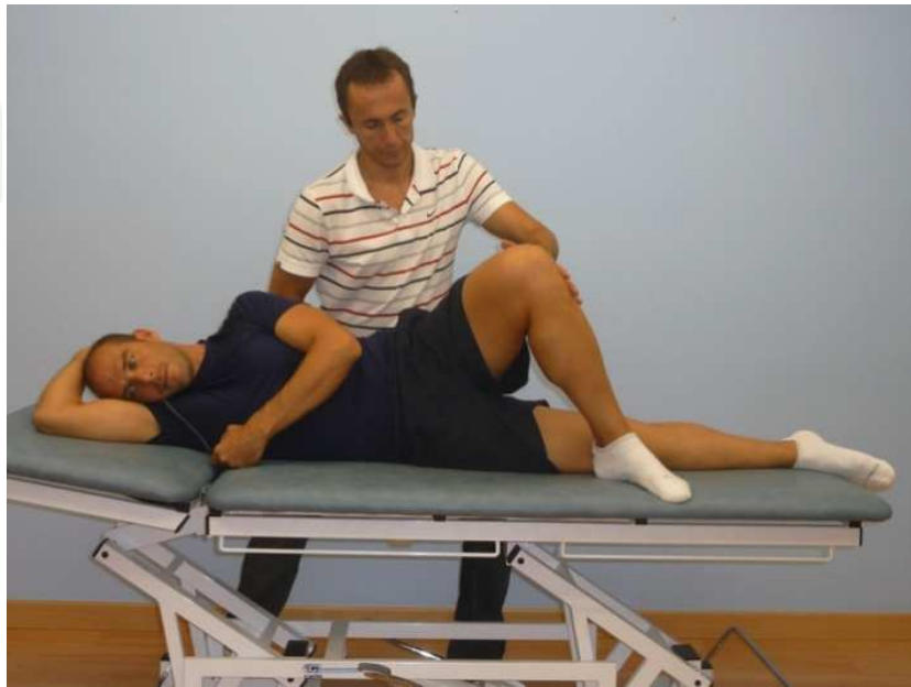
Fig. 6(b). Assessing muscle balance in the gluteus medius; ended position.

The action in this test combines hip abduction and slight lateral rotation to emphasize the posterior fibers of the muscle. Patient lies on one side with his knees flexed and feet together. This position will identify where muscle tone is poor. People should rotate their trunk forward until the chest is on the couch and allow the knee to drop over the couch side. From this position they lift the leg as before.