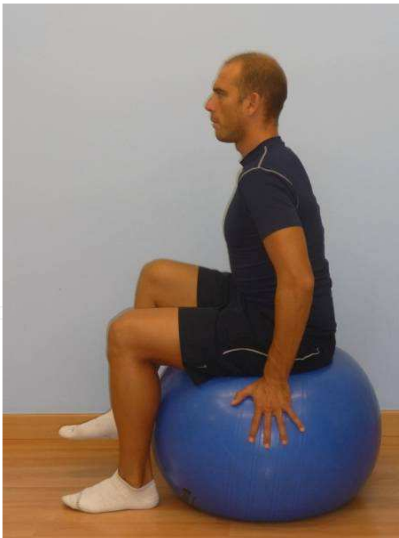
Fig. 25. Sitting knee raise on gym ball.