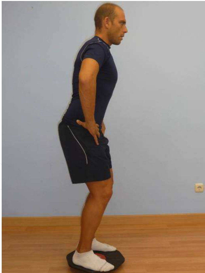
Fig. 17. Stand-up position on unstable surface.

The purpose is to maintain local muscle synergy contraction, while gradually progressing load cues through the body using weightbearing closed chain exercises. Weightbearing load is added very slowly, ensuring any weightbearing muscle at any kinetic chain segment is activated in order to give effective antigravity support and provide efficient and safe load transfer through the segments of the body. The focus is especially to ensure activation of the local and weightbearing muscles of the lumbar spine and pelvis, and the ability to maintain a static lumbopelvic posture for weightbearing. These muscles are likely to be dysfunctional in patients with low back pain. In addition, lifestyle factors of many individuals, which could have led to a dysfunction in these muscles, need to be addressed, as they may place them at risk of sustaining further low back injury.