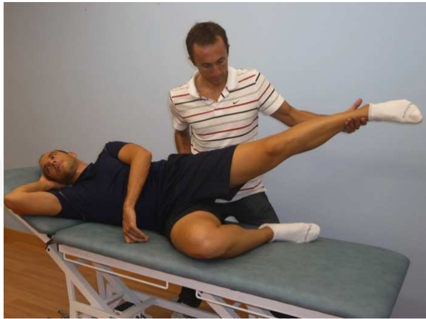
Fig. 4(a). Ober test; started position.