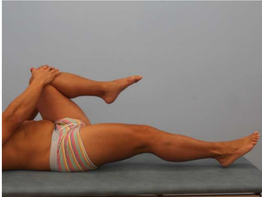
Fig. 3(b) Thomas test (iliopsoas shortened).