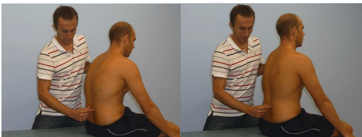
Fig. 16. Activation of multifidus from sitting to lumbar neutral position: looking for neutral position.