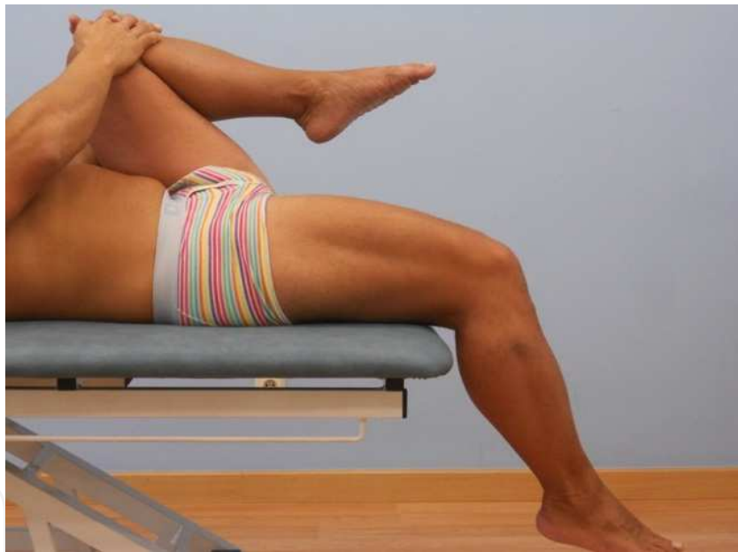
Fig. 3(c). Modified Thomas test (rectus femoris shortened).