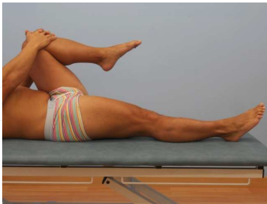
Fig. 3(a). Thomas test (no shortness).

The same procedure with the examined leg out of the table (figure 3c) elucidates a shortened rectus femoris. Optimal alignment occurs with the femur horizontal and aligned with the sagittal plane (no abduction) and with the subject's shoulder, hip, and knee more or less in line. A positive test is indicated when the tibia loses their vertical position due to knee extension. The test is negative when the tibia remains vertical.