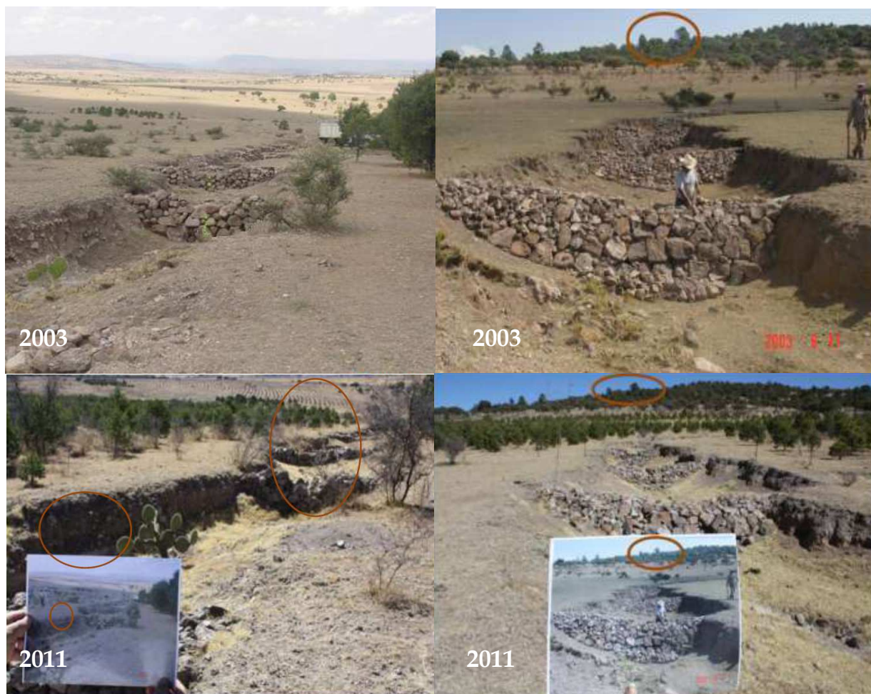
Fig. 2. Successful cases of ecosystem restoration. Ejido 16 de septiembre, Durango, Mexico.

The National Forestry Commission of Mexico (CONAFOR, as called in Spanish) through the ProArbol program provides incentives to forest owners who wish to perform actions for the protection, conservation, restoration and sustainable use of forest resources in Mexican ecosystems. CONAFOR has applied financial support for conservation and restoration in almost 494,000 ha from 2001-2007. Since 2005, CONAFOR has been the main partner of United Nations Convention to Combat Desertification in Mexico. One of the major projects implemented to combat desertification include the reforestation of degraded areas for soil conservation (Figure 2).