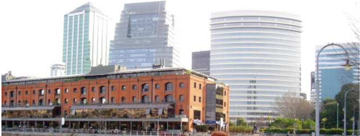
Fig. 1. Port of Puerto Madero (Argentina) , Port's zone dedicated to the visitors.

With the main idea of show the real actual situation of the security on the ports, the main objectives to be met with this survey are: