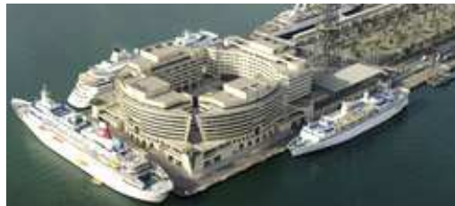
Fig. 3. World Trade Centre of Barcelona- Tourisyic Port Facility

While it is true that 60% of respondents recognized that there is compatibility between the normal routine and port security duties required by the ISPS, the remaining percentage indicated. Given that security should be met for all situations in accordance with the requirements of the ISPS is to understand which are necessary to implement measures to improve this significant percentage trying to reduce or mitigate these risks and incompatibilities. i.e figure 3.