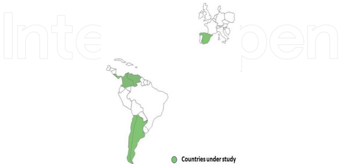
Fig. 2. Map of Countries under study

Following criteria and considering the limited number of experts in the area decided to contact area 13 experts covering the following regions: