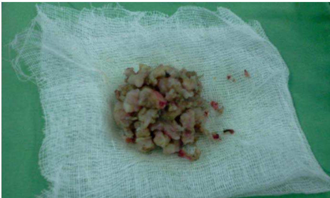
Fig. 3. Collection of myoma chips after resection.

In my series over a 15-year-period, six pregnancies occurred after the procedure, and the mean age of these women was 36 years (range, 34–40 years). Because pregnancies have been reported after endometrial ablation, patients cannot be guaranteed that this is a sterilization procedure, and the risk potential for a subsequent pregnancy must be explained and sterilization or contraception offered. Tubal ligation does not reduce distention media absorption and therefore need not be a prerequisite.