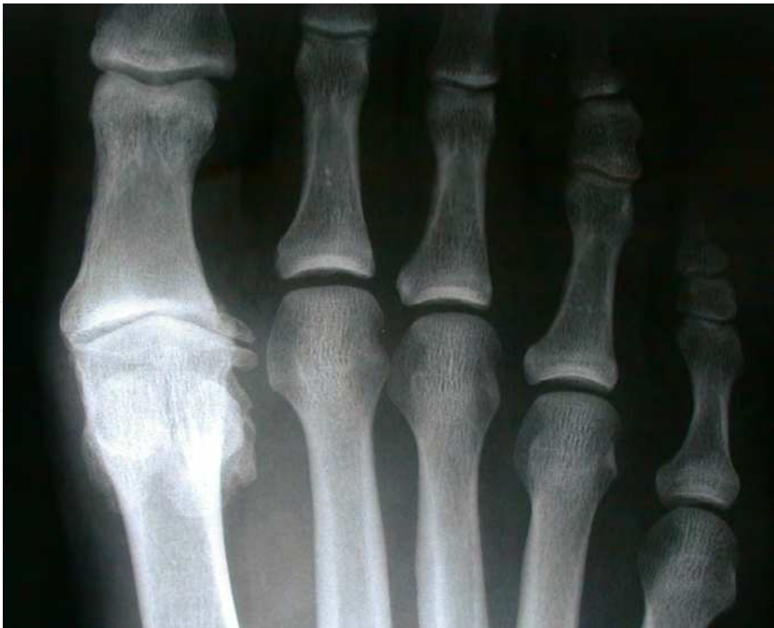
Fig. 1. Late Stage III Hallux Rigidus. Pre-operative AP radiograph with clear evidence of joint narrowing and osteophytic formation.

An isolated decompressional osteotomy of the first metatarsal is allowed to be weight bearing in a postoperative shoe. The DARCO® wedge shoe is preferred for the first three weeks, limiting forefoot loading and possible ground reactive forces that could displace the osteotomy. After week three the patient is then transitioned to a flat stiff soled postoperative shoe for an additional three weeks. Eliminating the propulsive phase of gait with a postoperative shoe is advantageous to the healing of the osteotomy; it does however tend to lead to stiffening of the first metatarsophalangeal joint. To counter the negative affects of a prolonged apulsive gate, it is critical to start early passive range of motion of the first metatarsophalangeal joint as early as postoperative day three. If chondroplasty of the joint was performed it is absolutely imperative that gentle passive range of motion of the first metatarsophalangeal joint is started early to prevent hemarthrosis, which could also lead to stiffening of the joint (Fig 5).