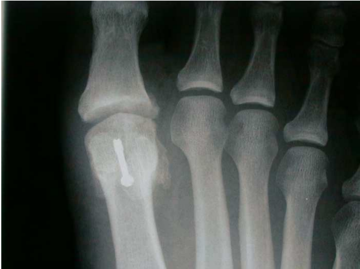
Fig. 3. Post-operative images of the same patient following decompressional osteotomy of the first metatarsal with cheilectomy. Note the significant increase to the first metatarsophalangeal joint space status post decompression. This patient exhibited improved range of motion post-operatively.

enable a successful fusion. Disadvantages of arthrodesis include possibility of nonunion or malunion, interphalangeal arthritis, prolonged postoperative time, transfer metatarsalgia, and the possible need for a second procedure to remove hardware. The loss of joint motion is not without potential problems, particularly in the more active patient.