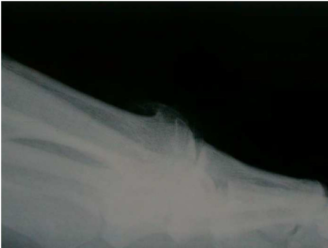
Fig. 2. Pre-operative lateral image of the same patient in Fig 3 with late Stage III Hallux Rigidus. Note the dorsiflexion of the first metatarsal, as well as the large dorsal osteophytic formation to the head of the metatarsal.