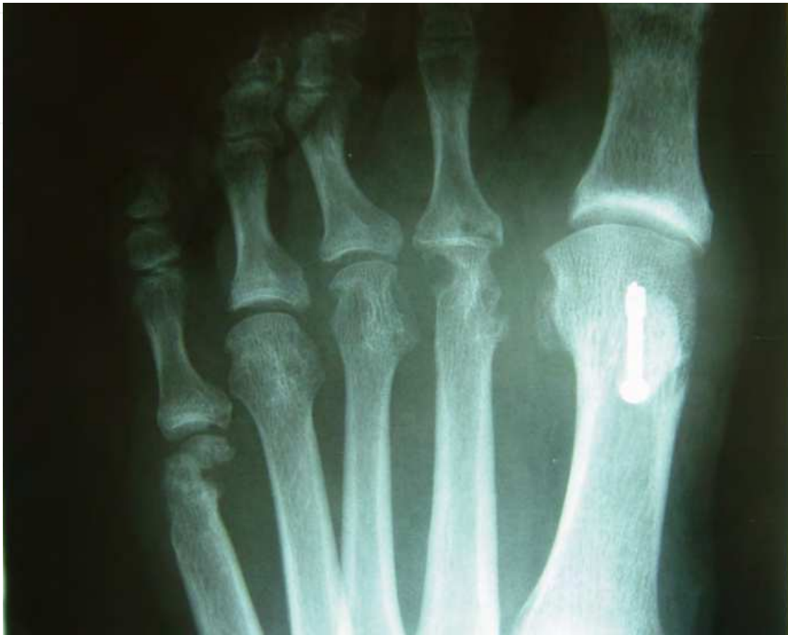
Fig. 7. Post-operative images following decompressional osteotomy of the first metatarsal in the same rheumatoid arthritis patient. In this case a joint preservation procedure was chosen because the patient's long standing rheumatoid arthritis came under control and there was reasonable cartilage remaining in her first metatarsophalangeal joint.

(28 feet) met the inclusion criteria. All of the returning patients were asked to complete a subjective 9-item questionnaire. No patients were reported as being worse or without any improvement. The mean AOFAS score was 25.9 preoperatively to 52 postoperatively out of a maximum 70. Of the patients 21 of 28 feet stated a 90% improvement with only 1 patient stating less than 50% improvement [Oloff & Jhala-Patel, 2008].