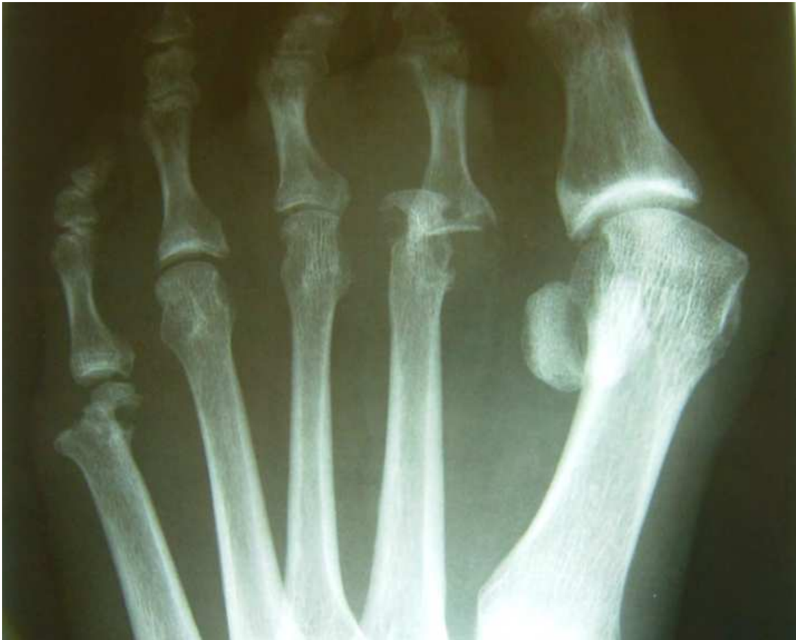
Fig. 6. Pre-operative AP image of a rheumatoid arthritic patient with Hallux Rigidus.

inappropriate for joint preservation. Traditionally the accepted treatment for such patients was resectional arthroplasty or arthrodesis. The approach to systemic inflammatory diseases continues to change with the fairly recent introduction of disease modifying anti-rheumatic drugs (DMARDs). These classes of drugs can limit the joint destruction and allow the consideration of joint preservation (Fig. 6-7) [Drago et al, 1984; Niki et al, 2010].