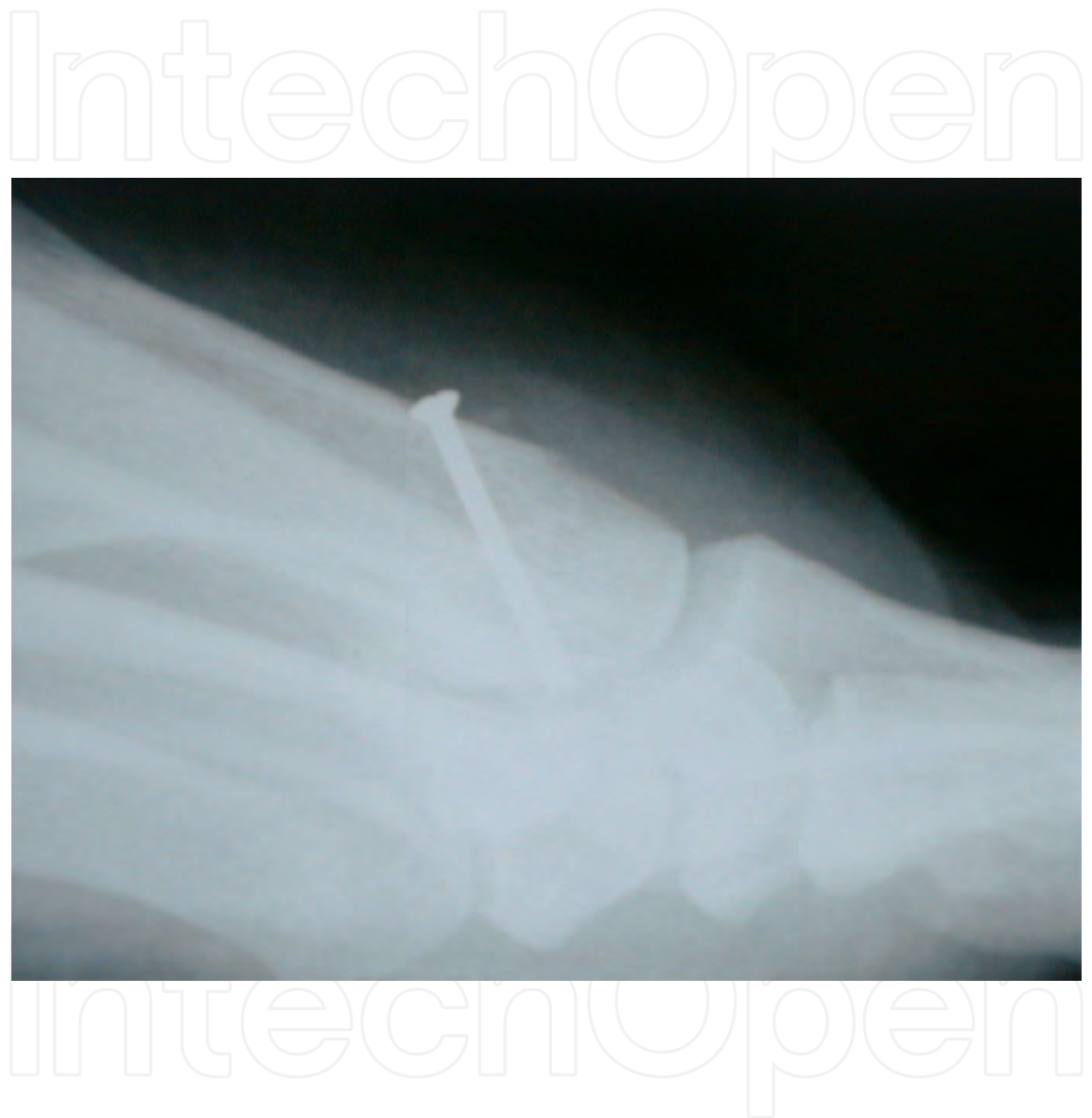
Fig. 4. Lateral radiographic image of the same patient revealing resection of the osteophyte from the dorsal first metatarsal. The increase in joint space can be appreciated in this image as well. Fixation of the osteotomy was provided with a single 3.0 mm short thread cortical screw.