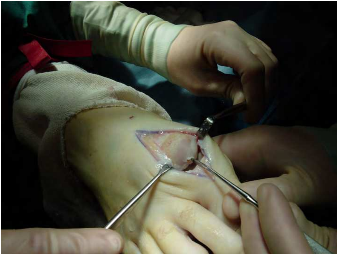
Fig. 5. Intra-operative image revealing degeneration of the dorsal articular surface cartilage. Also note the loosely adhered, friable cartilage toward the center of the joint. This is typical wear pattern found in patients with Hallux Rigidus. At this point chondroplasty of the articular defect should be considered. When performing chondroplasty, early mobilization is important to lessen the chance for ankylosis.