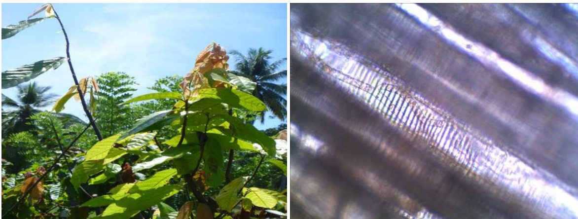
Fig. 2. Left: Cocoa tree in Sulawesi, Indonesia infected with VSD. Right: LS of a stem of infected cocoa showing hyphae of the causal organism, C. theobromae , in a xylem vessel, magnified x400.

A devastating disease of cocoa is witches' broom, caused by a co-evolved pathogen of cocoa, a basidiomycete species, Moniliophthora pernicioso . The disease causes distortion of growth in the shoots, creating a broom-like appearance. Although the pathogen co-evolved with cocoa, it has caused most damage in plantations in Bahia, Brazil away from its centre of origin in the Amazon rainforest. Improved management, including the appropriate use of fertilisers, combined with the introduction of resistant cocoa genotypes has been effective in mitigating the impact of this disease (Keane and Putter, 1992). Dieback in cocoa caused by L. theobromae has been observed in the Cameroons (Mbenoun et al., 2008) and in India (Kannan et al. 2010). Vascular streaking has been observed in both cases. Kannan et al. (2010) isolated the pathogen and reinoculated seedlings, which showed disease symptoms after 20 days. Infection by L. theobromae is facilitated by