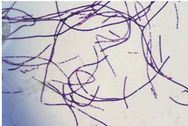
Fig. 1. Gram stain of Bacillus anthracis vegetative form from a colony growth on agar TSP 5% sheep blood. It is evident the typical bamboo-shaped filaments

capsule (sometimes only purple spots are observed, probably due to the material of the capsule: reaction of Mc. Fadyean).