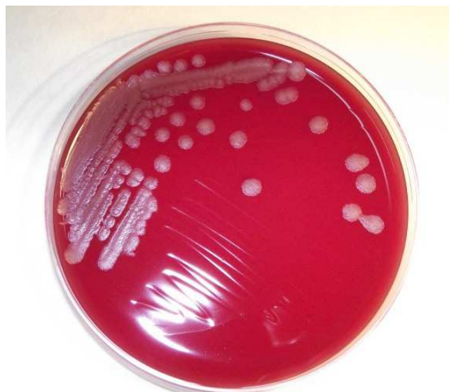
Fig. 2. Colony of Bacillus anthracis growth on TSP agar 5% sheep blood

B. anthracis grows well on ordinary culture media under aerobic or microaerofilia, at temperatures between 12°C and 44°C, but optimal growth occurs around 37°C and at a pH of 7.0 to 7.4. In tryptose broth there is a flocculation and then it forms a silky deposit. Colonies on plates form a magnificent plot called caput medusae (phase R or rough) ( fig. 2). For this reason is generally believed that the R phase of B. anthracis is the normal and virulent one, while the attenuated (vaccine germs) grow mostly in S phase. This would be an exception, as with other microbial species S phase is the normal and virulent phase. But it seems that the physiological condition for the growth of anthrax bacilli, including the presence of carbon dioxide concentration of at least 5% (which occurs in the alveoli), permits