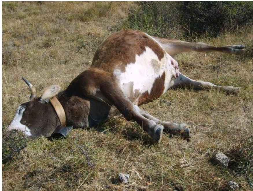
Fig. 4. Hyperacute form of anthrax in cattle

These events are always accompanied by high fever ( 41^{\circ}\text{C} and beyond) that tends to settle very early. In farms with active outbreaks it is possible to detect the sick animals by measuring body temperature before clinical symptoms appear. In sheep and goats most of the time evolution is hyperacute. The animals are suddenly struck by dizziness, staggering, falling to the ground and die in a few minutes with leakage of blood from the body's natural openings.