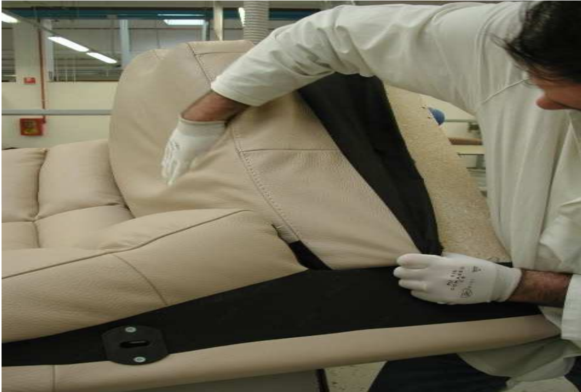
Fig. 2. Upholstery-assembly worker with arm-hand intensive work task.