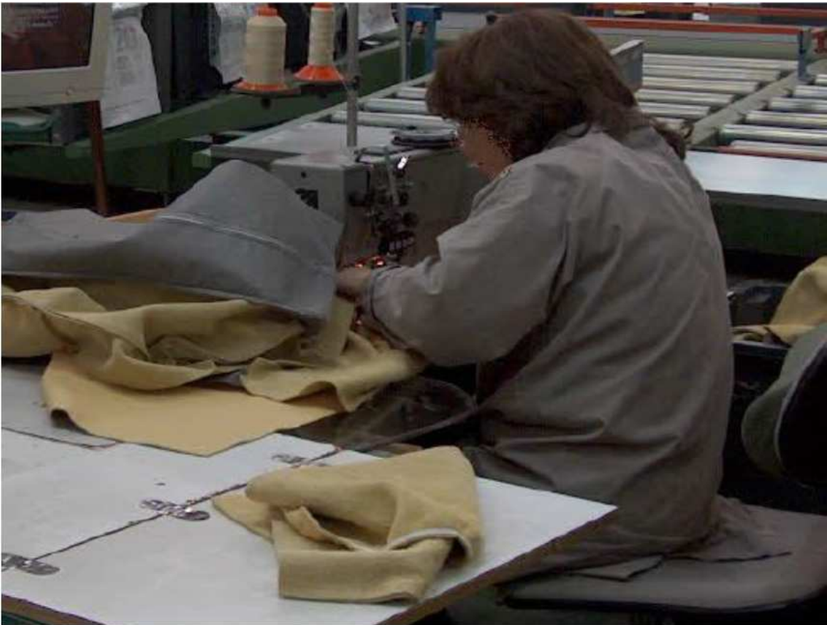
Fig. 3. The seamstress work task showed the highest incidence rates of carpal tunnel syndrome with a gender association.

application of the method achieved a concise and accurate assessment of the risk, even though the tasks analyzed in the upholstered manufacturing industry were not always very repetitive and stereotyped.