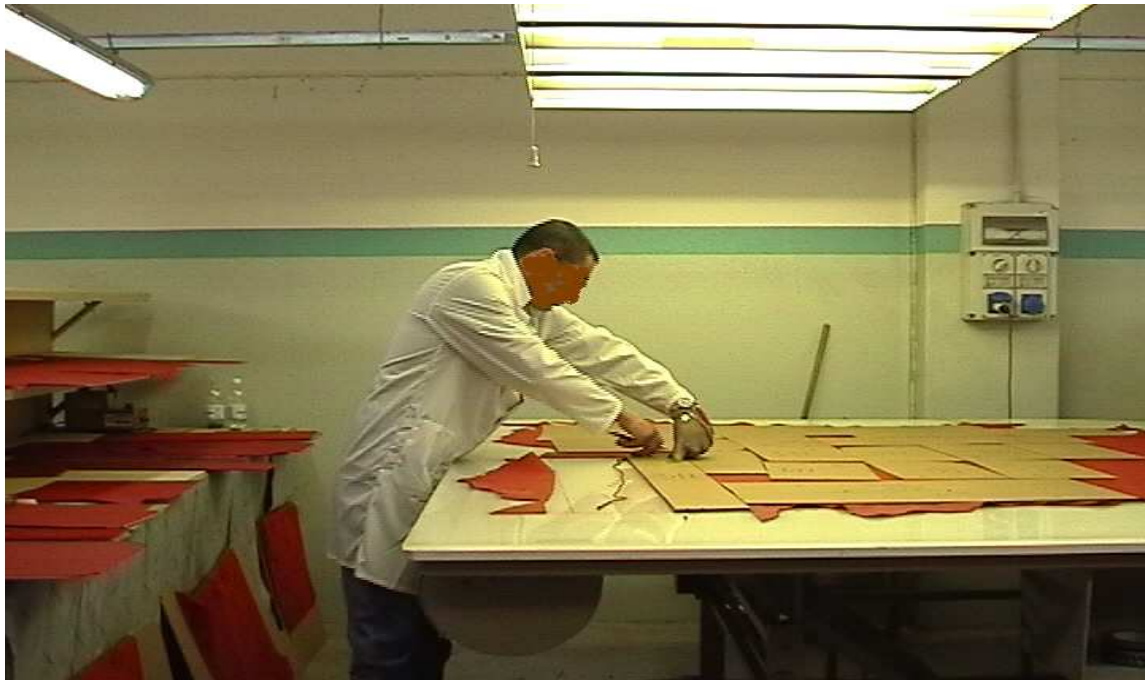
Fig. 1. The productive cycle in the upholstered manufacturing industry: the leather cutter.

The cut material (textile or leather) is then processed by the seamstresses in order to produce the definitive covering: this part of the cycle is made of separated phases that can be carried out from one single operator, or can be carried out in distinguished tasks. In this case the passage from one task to the others is made by the same (usually female) operator. The duration of a seam cycle is extremely variable. The effort of the operators depends on softness and thickness of the covering to be sewed (with one increasing progression from the woven to the microfiber, to soft leather, the thick leather until the crust) and from the complexity of the sofa model.