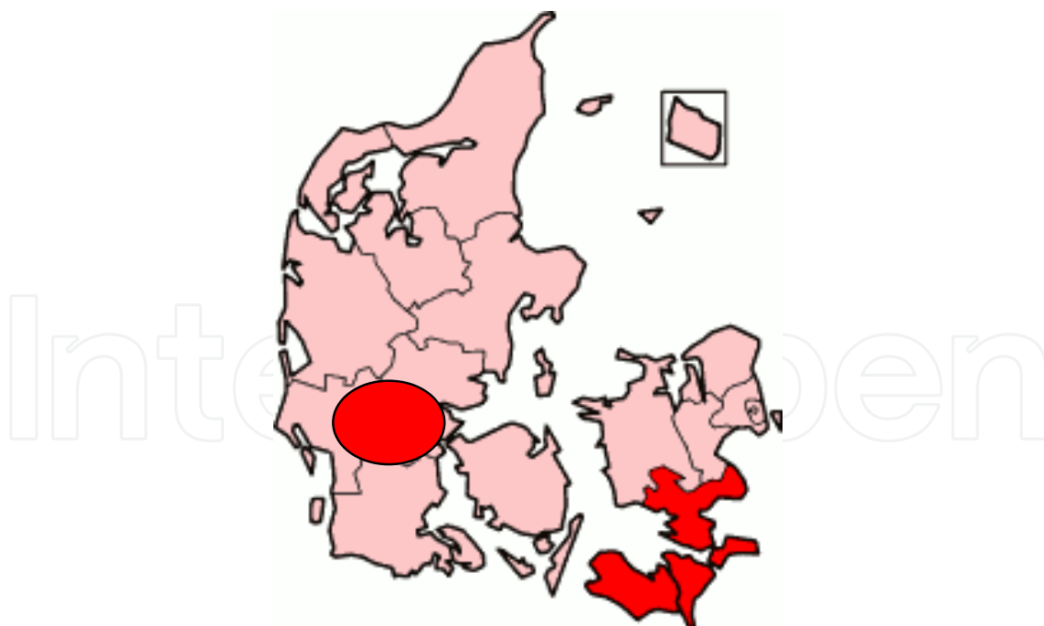
Fig. 1. Map of Denmark. The red highlighted areas are where the interview surveys took place.

The Storstrøm County (where study 3 took place) now part of the Region of Sealand 1 comprises an area of 3.398 km 2 and has 262.781 inhabitants. The area has continuously experienced a fall in agricultural and manufacturing employment. There has been a rise in building and construction industry but the great growth rates in business services occurring in the rest of the country has not taken place here (Lundtorp et al., 2005). The area has had a marginal position for many years but within the last 10 years the number of newcomers to the area has been growing and so has their incomes and education level (Aner, 2007). Characteristically the area is gradually becoming part of the metropolitan labour market (Lundtorp et al., 2005).