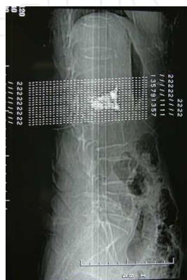
Fig. 6. Locating CT film after operation.