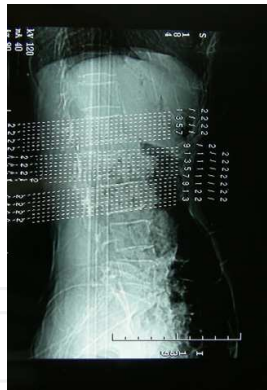
Fig. 3. Locating CT film before operation.