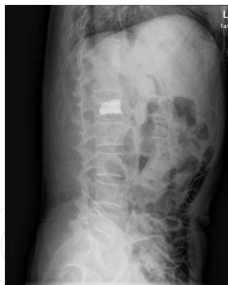
Fig. 9. Lateral X-ray after PKP.