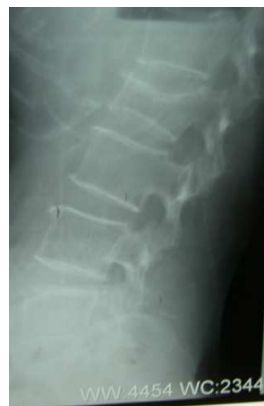
Fig. 1. Lateral X-ray at admission.

In this group of patients, the volume of bone cement injected in each vertebral was 3 ~ 6.5ml. When intraosseous vertebral venography were performed before the injection of bone cement, paravertebral vascular developed an image in 5 cases, then filled the gelatin sponge; peripheral cement leakage was found in 4 cases, intervertebral disc leakage was found in 2 cases and posterior margin leakage was seen in 2 cases (posterior longitudinal ligament is not exceeded), no clinical symptoms appeared. No nerve root or spinal cord injury, no pulmonary embolism or other complications were recorded. All patients had no further vertebral fractures. At admission,preoperative and postoperative X-ray films were shown in Figure 1-7. Figure 2 showed that bolster for self-replacement restored vertebral body height, corrected the kyphosis angle. Figure 5-7 showed that the PVP surgery could maintain and enhance the effect.The stata was showed in Table 1. Bolster for self-replacement combined with percutaneous vertebroplasty significantly improved VAS scores, analgesic use score and activity score, The results were shown in Table 2.