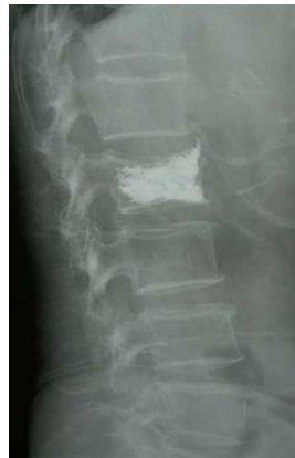
Fig. 5. Lateral X-ray after operation.