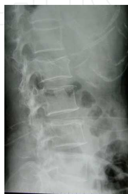
Fig. 2. Lateral X-ray before operation.