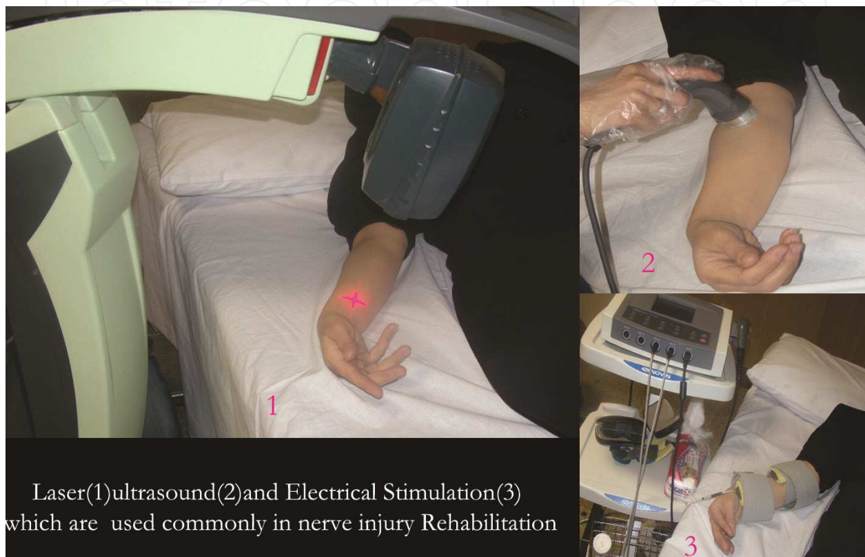
Fig. 4. Common modalities in nerve injury rehabilitation by Reza S Roghani, Rehabilitation University, Tehran, Iran

The insensitive joints and ligaments and other surrounding tissues which are affected by the injury to all or some supplying nerves are at the risk of stiffness, shortening and finally contracture. Regular daily massage, passive motion in full range at least one time per day and protective detachable static splints could prevent these complications. In case of joint stiffness dynamic splints and physical modalities such as ultrasound and laser [Fig4] will help to regain the softening and range of motion. [19]