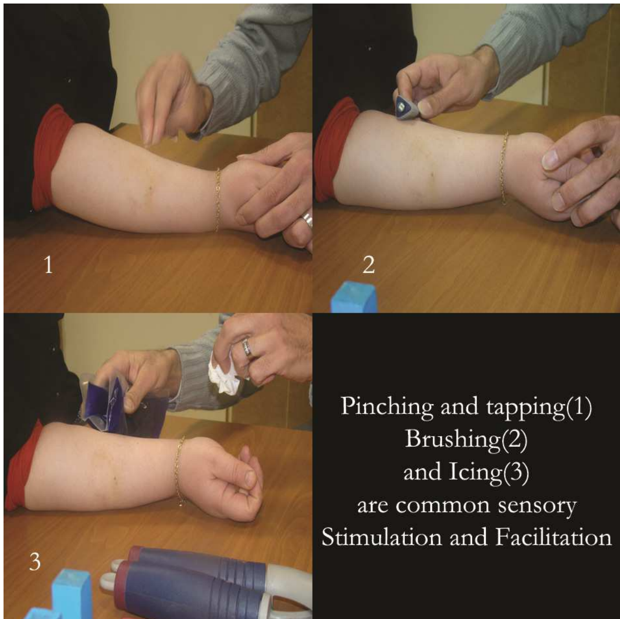
Fig. 1. Sensory stimulation and facilitation by Reza S Roghani, Rehabilitation University, Tehran, Iran

or an art, it is usually necessary to become familiar with some proprioceptive tasks specific to that activity.