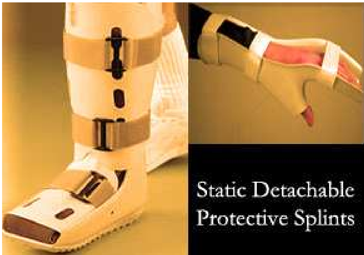
Fig. 2. Static and detachable splints by Reza S Roghani, Rehabilitation University, Tehran, Iran

Static and detachable splints [fig2] is useful mechanical devices to give rest to the paralyzed muscles and joints, preventing overstretching and shortening and to allow exercises and other therapeutic methods to be given regularly for preventing complications of continued immobilization.[16]