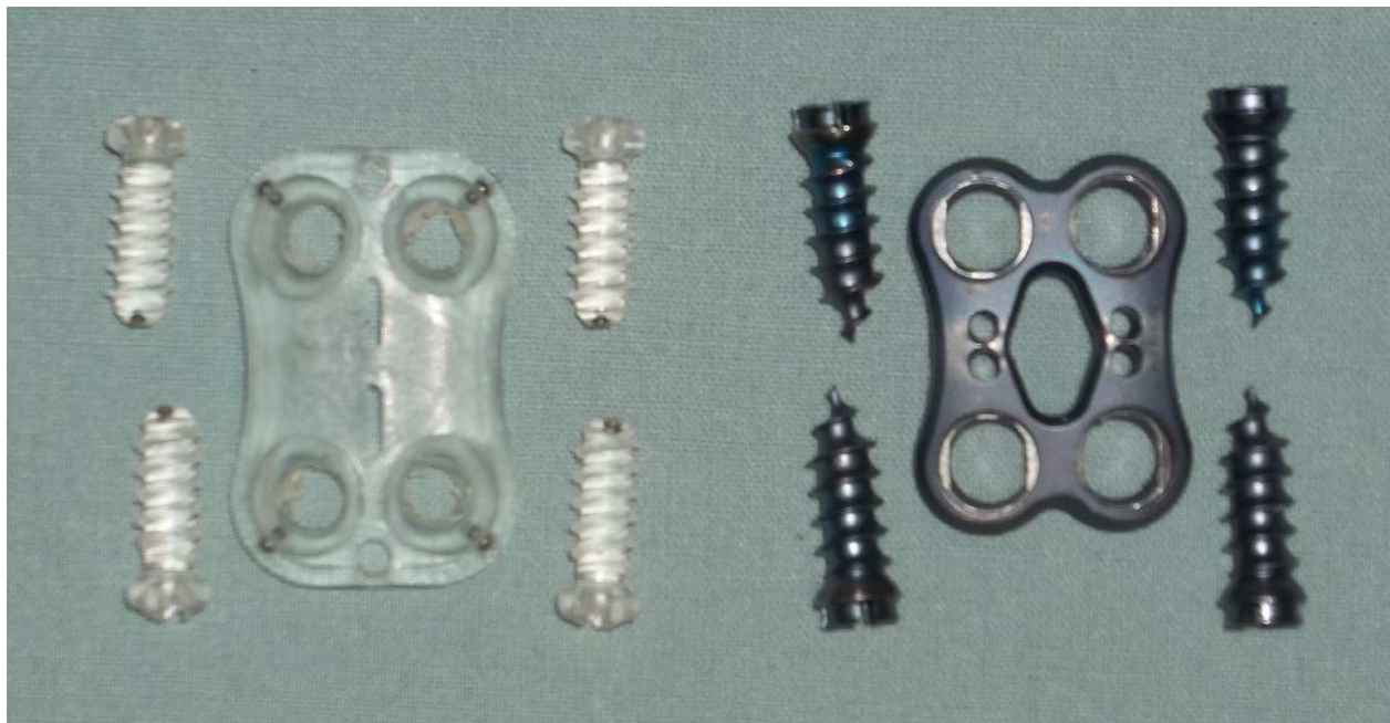
Fig. 4. Resorbable Plate and Screw System (Left) beside Nonresorbable titanium system (Right)

Resorbable plate and screw systems (RPSSs) have been used as far back as the 1970's, shortly after the introduction of their clinical potential, to fix mandibular fractures (Kulkarni et al. 1966; Kulkarni et al. 1971). More recently, RPSSs have been used to successfully treat distal radial fractures with no statistical difference compared to a titanium control (van Manen et al. 2008). RPSSs have also been shown to successfully treat rib fractures in trauma patients (Mayberry et al. 2003). Once adapted for use in spinal applications, RPSS's have been investigated for supplemental anterior fixation to cervical interbody fusion constructs. Although prospective randomized studies to date are limited, many retrospective analyses have concluded resorbable anterior cervical plating as a reasonable alternative to metal (Vaccaro et al. 2002; Franco et al. 2007; Tomasino et al. 2009). RPSSs have also been considered for supplemental lumbar fixation (DiAngelo et al. 2002), however in-vivo loading conditions of the lumbar spine may prove too intense for this application.