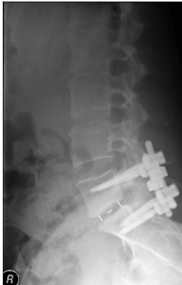
Fig. 3. Planar X-ray of Patient Immediately after Surgery with PEEK Cage and Titanium Rod Construct Implanted in the Lumbar Spine

Although PEEK implants offer improvements over titanium and titanium alloys, they are still subject to such complications as migration, subsidence, extrusion, wear debris and late foreign body reaction due to the fact that they are permanently implanted (Alexander et al. 2002; Smith et al. 2010). Furthermore, additional surgeries may be required to remove the constructs. These limitations have led clinicians to investigate bioresorbable polymers for use in surgical applications. Alpha-polyesters, mainly polylactic acid (PLA) and polyglycolic acid (PGA), are the primary bioresorbable materials used in clinical applications, and over the past decade such compounds have been used extensively in craniomaxillofacial, orthopedic and trauma applications for bone reconstruction and fixation.