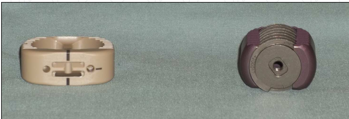
Fig. 2. PEEK Lumbar Interbody Cage (Left) alongside Titanium Lumbar Interbody Cage (Right)

Thermoplastic polyetheretherketone (PEEK) polymers, a subset of the polyaryletherketone or PAEK class of polyaromatic polymers, were initially considered for use in spinal applications to overcome the aforementioned limitations due to their inherent material properties, such as biocompatibility, radiolucency, and the ability to tailor their elastic moduli with fiber reinforcement such as carbon filament. Neat or unfilled PEEK has an elastic modulus of approximately 3.6 GPa, however this can be tailored to closely match cortical bone (18 GPa) or even titanium alloy (110 GPa) (Kurtz & Devine 2007). These properties, along with validation of their strength, wear, creep and fatigue resistance have pushed PEEK implants to be the most viable and attractive alternatives to metallic spinal implants to date. (Brown et al. 1990; Brantigan & Steffee 1993; Kurtz & Devine 2007). Figure 3 is an x-ray taken from a patient following implantation of a PEEK cage along with a pedicle screw and titanium rod system. Notice the radiolucency of the PEEK cage; only the radiopaque markers inside the implant are visible.