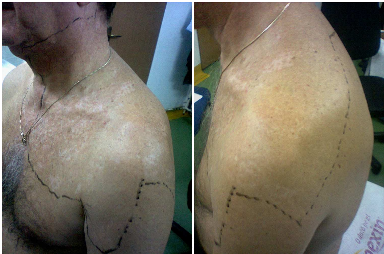
Fig. 1. a)

suggests central sensitization process on spinal level by pre- and post-synaptic changes on second-order neuron induced by ongoing C input: temporal summation, mechanical dynamic and static allodynia. Analyzing the patient's pain in this manner, it is easier to choose the potential optimal pharmacological agents. For this patient a selective sodium channel blocker, like carbamazepine or tricyclic antidepressive and \mu -receptors agonists, opioids, are not suitable because of myasthenia gravis. A calcium-channel blocker \alpha 2- \delta ligand was recommended with a rating of 8 (VAS) for the mean pain intensity per month. Further local application of capsaicin patch (8%) lowered the pain up to a rating of 5, which the patient considered acceptable in the long run.