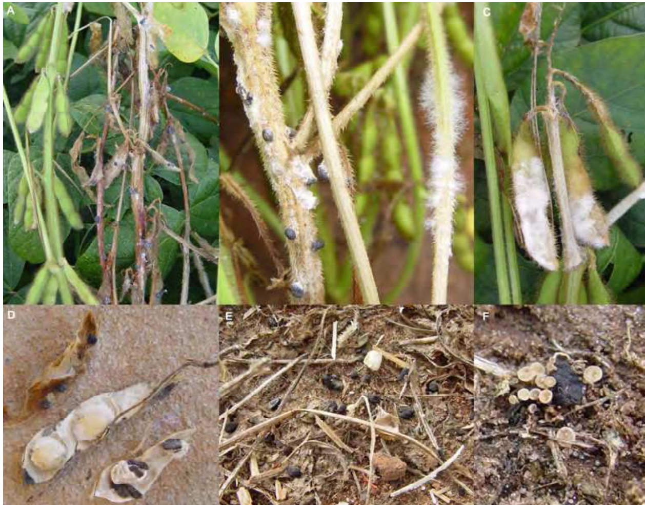
Fig. 1. Soybean plants showing symptoms of Sclerotinia sclerotiorum . Mycelium colonizing tissue into the host tissues of stems (A-B), leaves, and pods (C). Newly produced sclerotia on stem (A-B), diseased pods (D), and soil surface (E). Apothecia from sclerotia on soil surface (F). (Source: Mônica C. Martins, Fundação BA, Barreiras, BA, Brazil, 2008/2009 growing season).

such as the use of fungicides or resistant cultivars. The analysis of S. sclerotiorum structure and population dynamics is an essential part of understanding how the underlying mechanisms are involved in the history of this pathogen and its distribution across different geographic areas and wide host range.