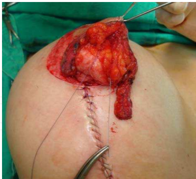
Fig. 6. A satisfactory projection of the nipple was seen at the end of the procedure.