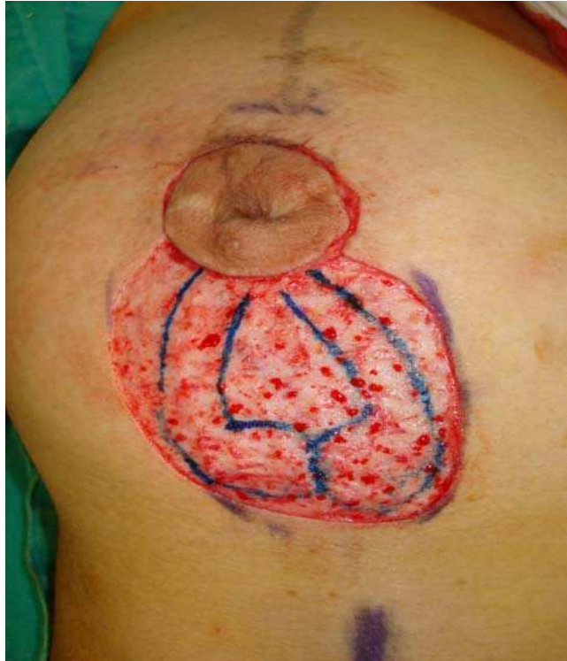
Fig. 4. The marked area below the areola was de-epithelialized. Antenna flaps were marked on this area.

Flaps were elevated to include dermis and 5 mm of fat tissue beneath and attached to the dermal flap using an electrocautery (Fig. 5).