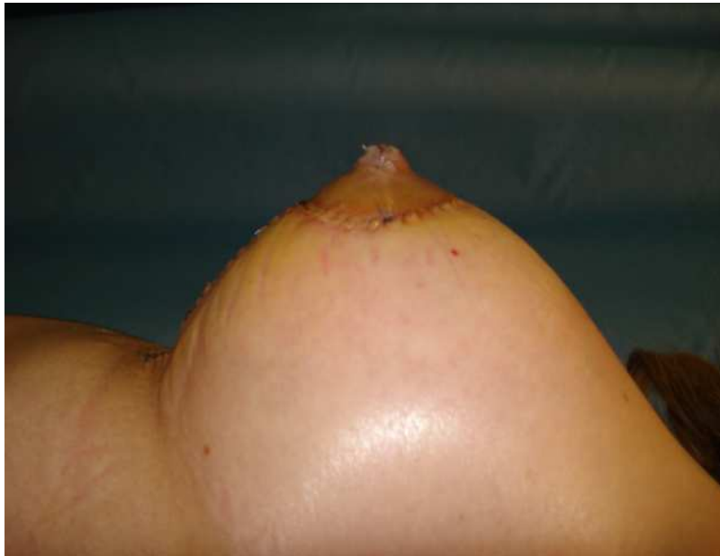
Fig. 7. Early postoperative result is seen.

It has been reported that the patients tolerated the procedure well. No major vital complications like major flap or nipple necrosis has been reported with this technique. In this technique, a high rate of success has been reported that no recurrence of nipple inversion after one and a half-year reported. As of patient satisfaction the technique seems promising that the shape and projection of the patient's nipple was deemed satisfactory (Fig. 8, 9).