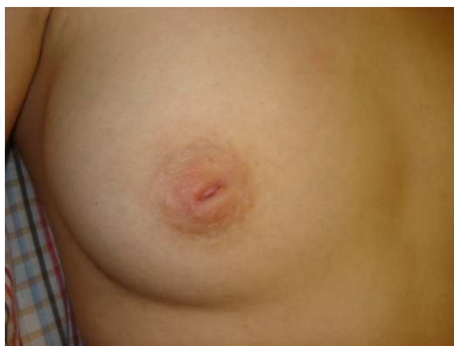
Fig. 1. A 24-year-old nulliparous woman with a history of congenital inverted nipple is seen. AP view.

Inverted nipple is defined as a non-projectile nipple (Sanghoo & Yoon, 1999; Kim et al., 2003; Stevens et al., 2004) (Fig 1). The nipple is located on a plane lower than the areola. The nipple is invaginated and instead of pointing outward, is retracted into the breast parenchymal and stromal tissue.