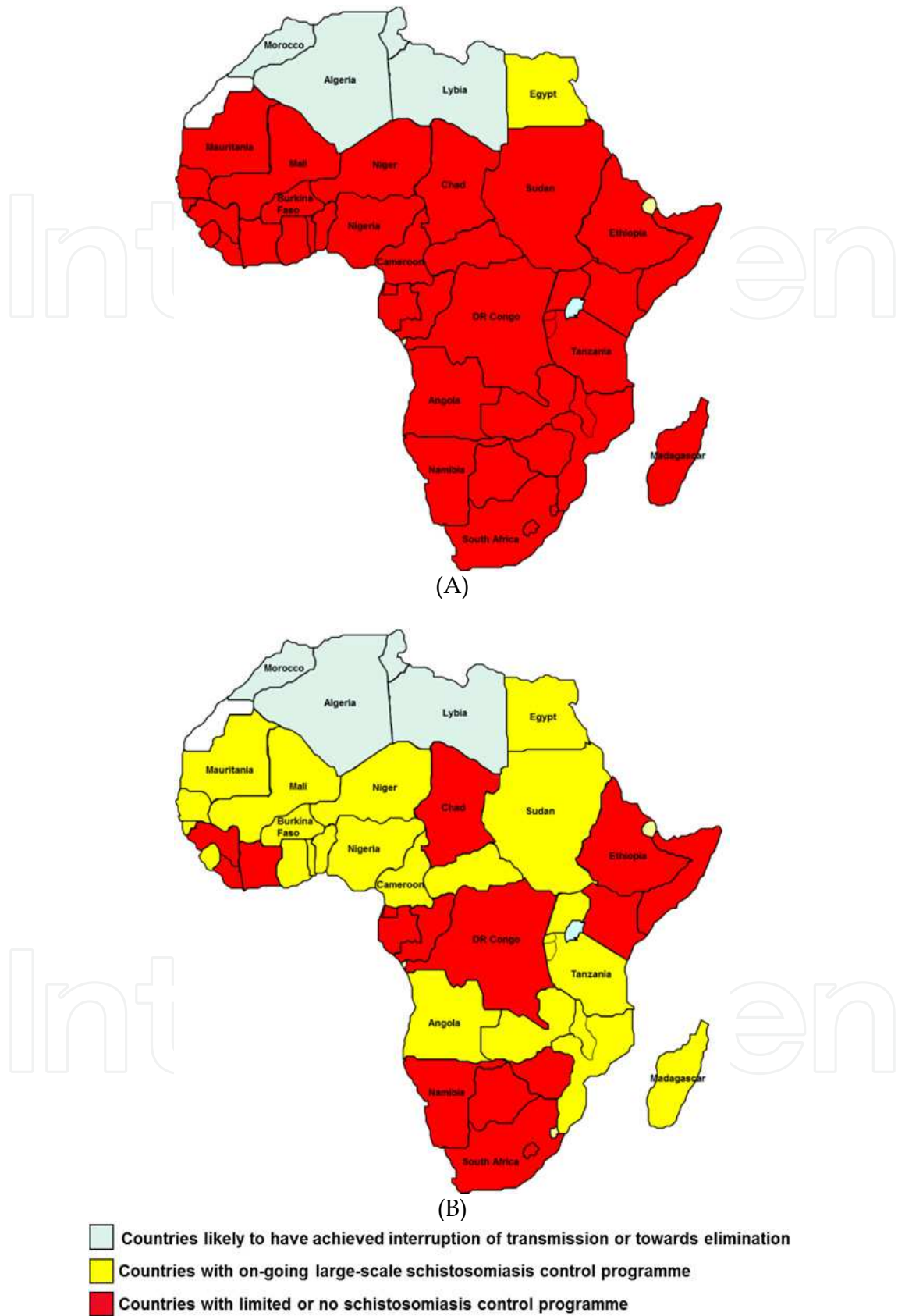
Fig. 1. Comparative status of schistosomiasis control in Africa at the end of the 20th century (A) and in 2010 (B).