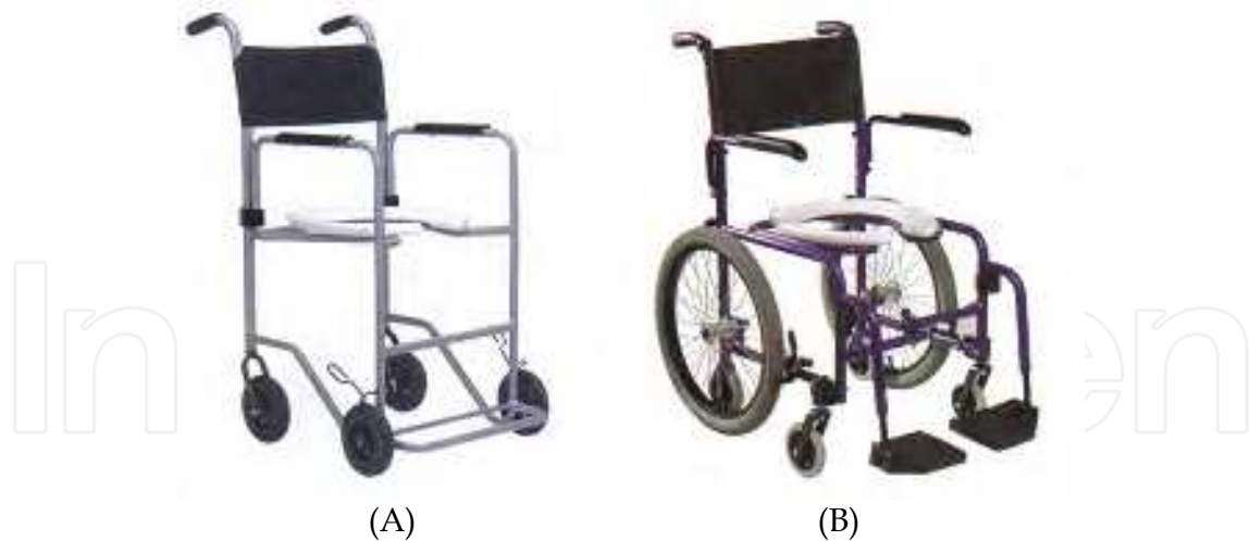
Fig. 3. Adult aluminum shower bath chairs: (A) Fixed structure and (B) Folding structure for closing.

the position of the head against gravity; moreover, the bending system of the seat and back group ("tilt") of up to 35^\circ allows a better accommodation for a person with absent or insufficient trunk control, who are unable to remain seated without support.