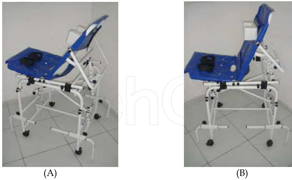
Fig. 6. Youth bath chair: (A and B) Removable base with height adjustment and belt and headrest system.

Other bath chair models (Figures 7 and 8) are designed to serve severe motor impairment users also have similar aspects, differentiating in some structural features, design and accessories. They are products whose tubular structure is often made of aluminum and the seat and back set consists of a polyurethane shell form-fitting, with or without holes, whose function is let the water flow during bath or shower.