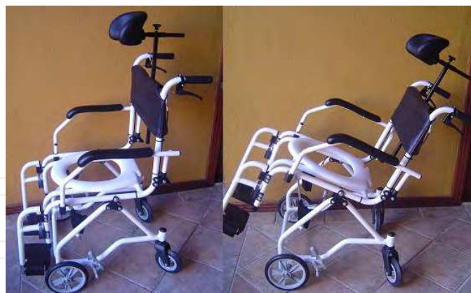
Fig. 4. Aluminum bath chair with backrest and headrest tilt system.

The presence of arms and legs support, which might be retractable or removable, supplement the necessary resources that permit a better accommodation of the user. Although the equipment presents more adequate features, the needs of more severely compromised people in the physical aspect, and the possibility of changing the adult toilet seat to a child one, implies that the dimensions offered by the equipment makes its designation more appropriate especially to adults.