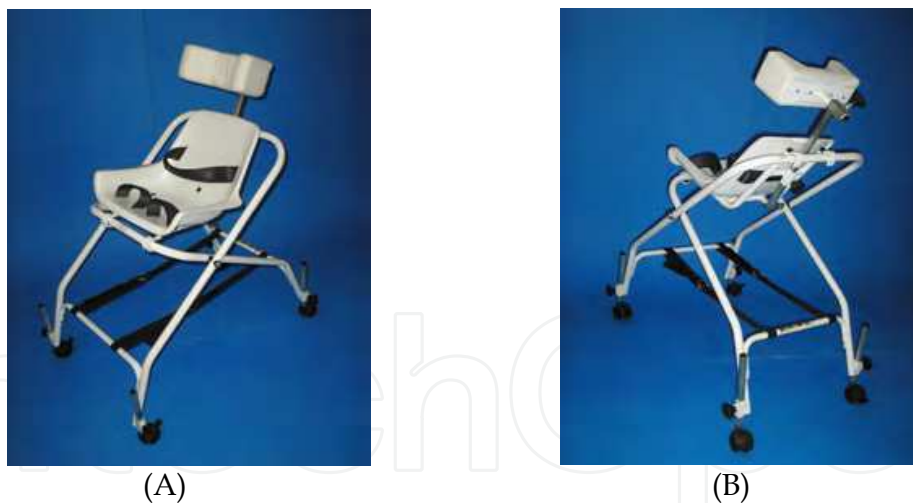
Fig. 7. Infant bath chair: (A) anterolateral view; (B) posterior-lateral view.

Other bath chair models (Figures 7 and 8) are designed to serve severe motor impairment users also have similar aspects, differentiating in some structural features, design and accessories. They are products whose tubular structure is often made of aluminum and the seat and back set consists of a polyurethane shell form-fitting, with or without holes, whose function is let the water flow during bath or shower.