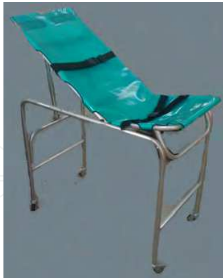
Fig. 5. Bath chair with recline tilt system.

Among these AT devices aimed for bathing or showering that have specific features to the demands imposed by more severely handicapped users, there are other models whose dimensions meet more specifically children and teenagers. These models, in their own constitution, usually have a range of resources appropriate to meet some specification, such as lack of motor control, including absence of neck control, insufficiency or default of trunk control, persistency of primitive reflexes and/or involuntary movements difficult to control, a situation that is compatible to people that with cerebral palsy or other disease that seriously compromise the musculoskeletal system.