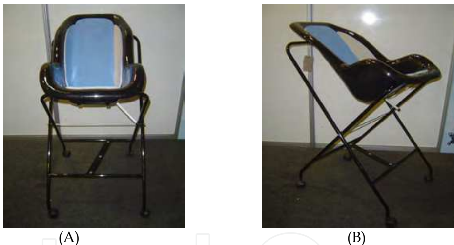
Fig. 8. Bath chair: (A) anterior view; (B) side view.

The bath chair presented in Figure 8 is a device produced by a small business, made of painted steel, with a seat and back system made by a plastic sheet and non-slip fabric. It has an "X" locking system concerning its width, while its length remains unchanged after being closed. As it is a tailored-made product, it is possible to get it according to the user measures, caregiver height and dimensions of the environment in use. The presence of foot casters for favoring moving is optional, although, because the seat and backrest are fixed, it is often necessary its transportation to be dried and cleaned.