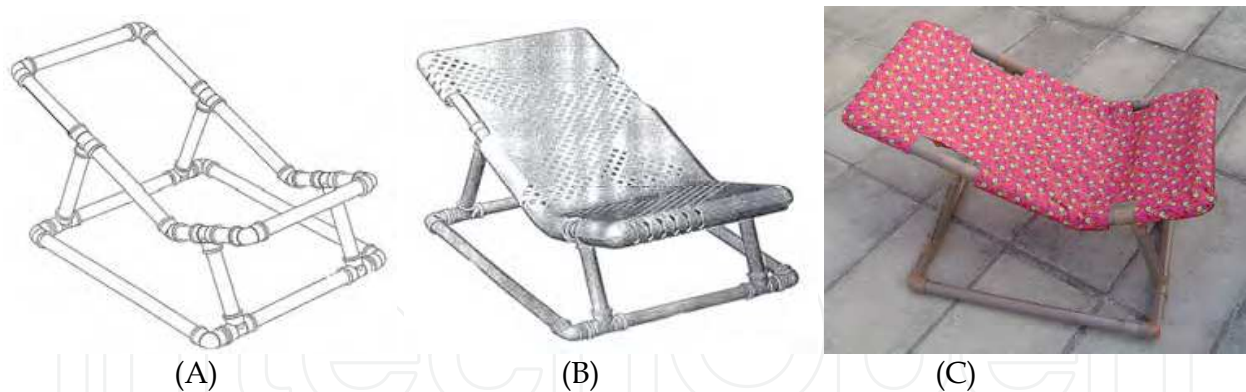
Fig. 10. (A) and (B): PVC pipes and connections structure; (C) Final craft model.