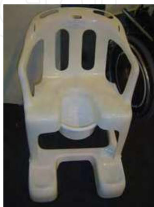
Fig. 2. Chair with cut out seat.