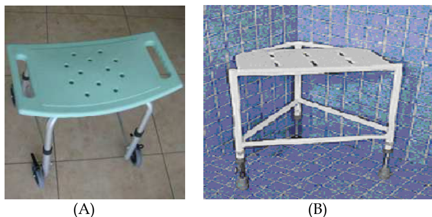
Fig. 1. Models of stools: (A) Four support stool with height adjustment; (B) Edge stool with adjustable height.

The more commonly available equipments to help a person who needs support to remain sitting during shower or bath because of temporary or permanent motor commitment. There are many models in the market which can be made specifically for this purpose, as well as other ones that are available for other purposes but adapted for such task. Most of the conventional models are made of plastic with rubberized coating with variations in their design in relation to the model and dimension of the seat and backrest, armrest and variation in height (Figure 1 and 2).