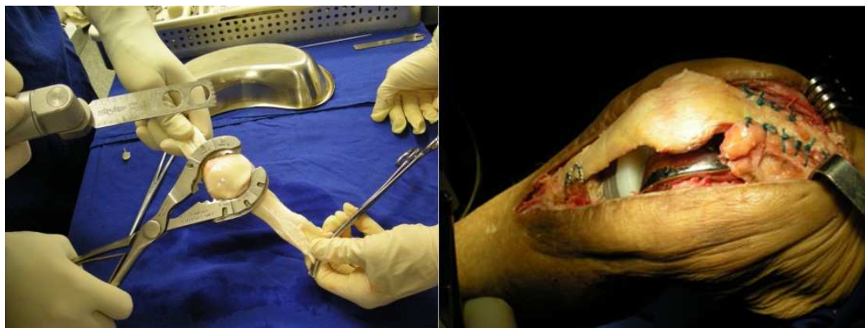
Fig. 6. and 7. Patellar tendon allograft transplant.

By the time of transplantation, all tissues processed are subjected to rigorous quality assurance criteria. It requires the evaluation of all data pertinent to the donor, test results, maintenance and control of equipment, materials and instruments used in all phases of each procedure (Figures 6 and 7).