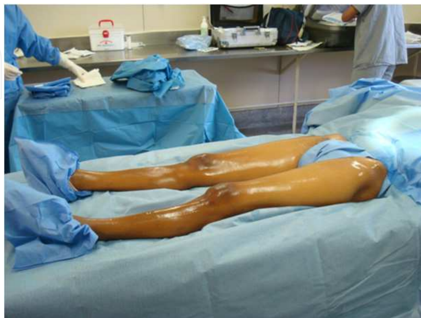
Fig. 1. Pre-operative preparation of the potential musculoskeletal tissues doner.

A very important step of the process of capture is the reconstruction of the donor and for this matter we use prosthesis specially designed using plaster, wire suture, gauze. This reconstruction is done rigorously and is characterized as the most laborious phase of the procedure. All anatomical parameters are respected, and therefore the deformation of the donor does not occur (Figures 1 and 2).