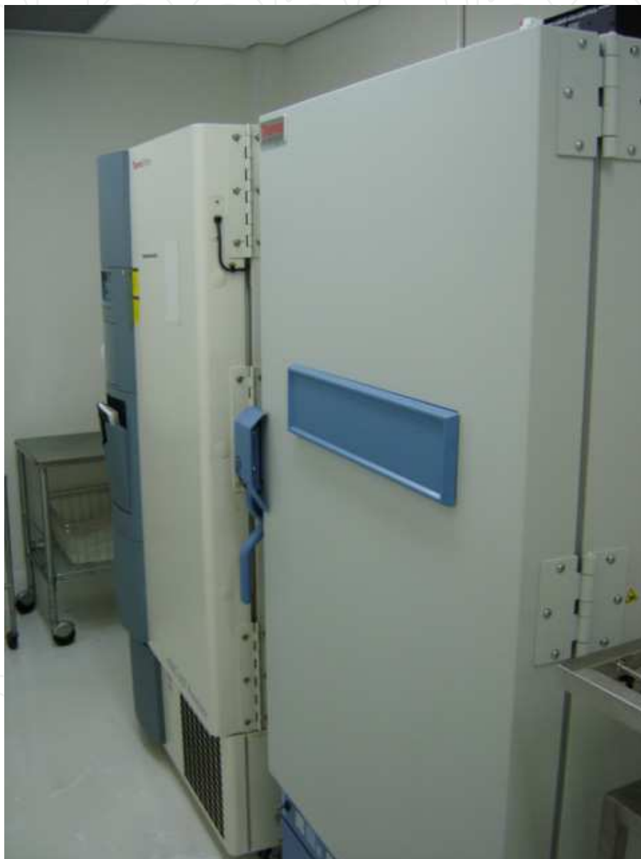
Fig. 3. Tissue cryopreservation área. Ultrafreezer with a temperature of -80^{\circ}\text{C} .

planning of activities needed for its implementation, such as provision of materials and instruments, convocation of the processing team, definition of preparation and dimensioning according to the need for service (queue) requests from orthopedic and dental surgeons. This step is performed in the operating room properly rated (class 100 or ISO 5) equipped with integrated laminar flow (Figure 3). The room also has an antechamber and pass-through and all environments have strict control of air particles and positive pressure for quality assurance of tissues processed there.