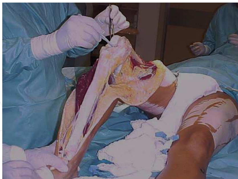
Fig. 2. Tissue removal: bone and tendon dissection under aseptic conditions.