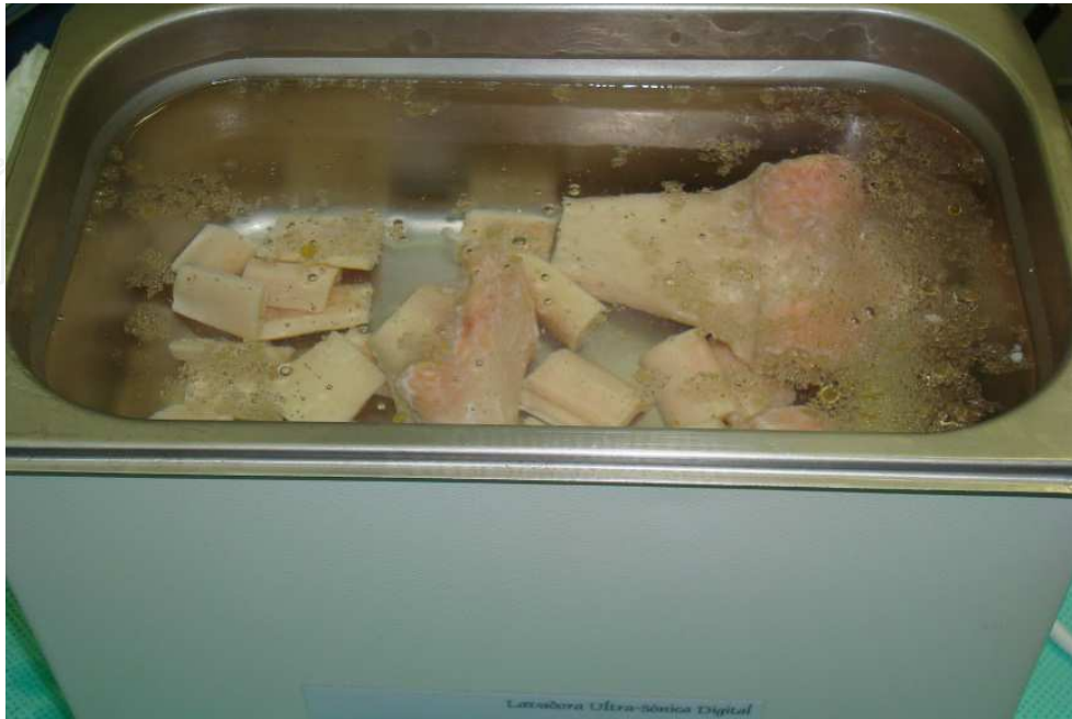
Fig. 5. Tissue's chemical processing. Ultrasonic clining with emulsifying solution.

adventitial tissue such as blood, periosteum, subcutaneous tissue, muscle, fascia and fibrotic tissue. Then, these tissues are immersed in emulsifying solutions based on hydrogen peroxide and alcohol under ultrasonic agitation (Figure 5).