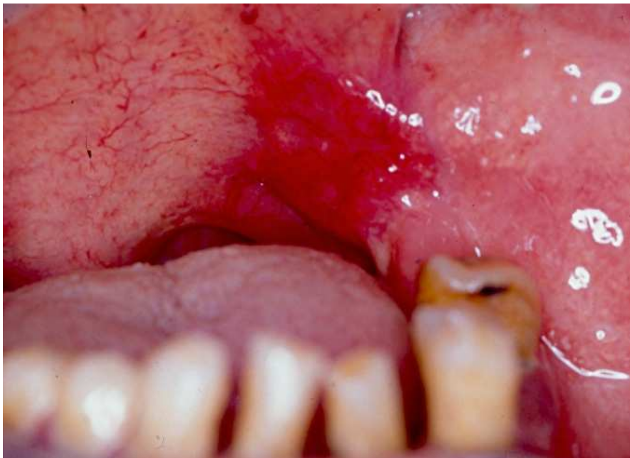
Fig. 1. Erythroplastic oral squamous cell carcinoma.