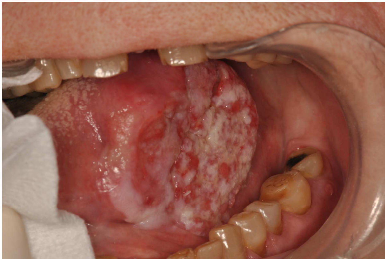
Fig. 3. Ulcerated-type tongue squamous cell carcinoma.

Ulcerated-type oral squamous cell carcinomas are usually diagnosed at stages III or IV (Jaulerry, 1985) (Figure 3). Although the predictive value of the clinical appearance of the primary lesion remains controversial, it is accepted that ulcerated lesions imply poorer survival rates (Jaulerry, 1985).