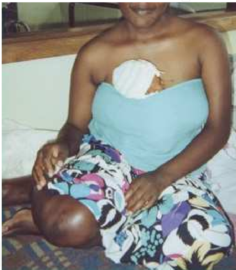
Fig. 1. Kangaroo Mother Care

The impact of cup feeding or bottle feeding on weight gain, oxygen saturation, and breastfeeding rates of preterm infants was examined in 34 bottle-fed and 44 cup-fed preterm infants (Rocha et al, 2002). No significant differences between groups were found with regard to time spent feeding, feeding problems, weight gain, or breastfeeding prevalence at discharge or at 3-month follow-up. Possible beneficial effects of cup feeding were lower incidence of desaturation episodes and a higher prevalence of breastfeeding at 3 months of age (Rocha, et al., 2002).