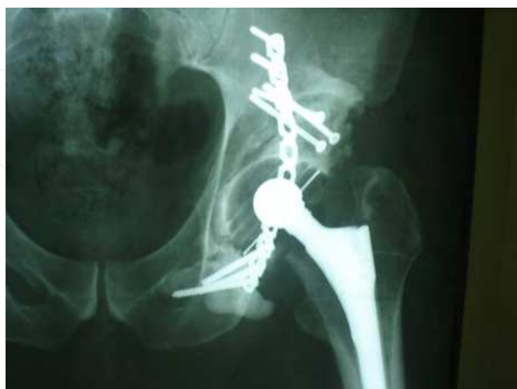
Fig. 5. reconstruction of defect with bone graft and cemented cup.