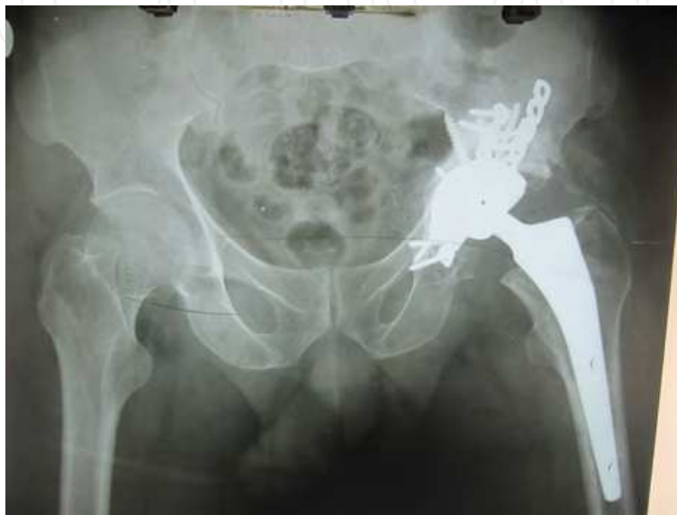
Fig. 6. Cement less cup and cementless stem.

If trochanteric osteotomy has been done for previous acetabulum surgery, screw removal is not necessary always for insertion of femoral stem. Surgeon can start preparation of femur for insertion of femoral stem, if the screws are found in the way of broaches, then removal of screws should be done.