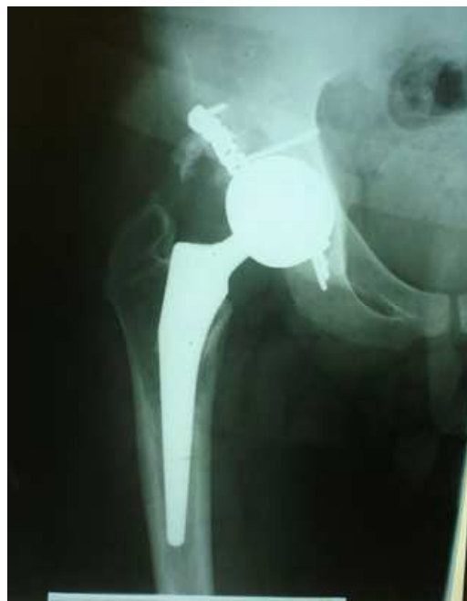
Fig. 8. Rapid wear of acetabulum with bipolar prosthesis (after 5 months).