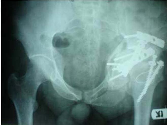
Fig. 2. Destructive joint disease after acetabulum fracture.

One of the most common complications of acetabular fractures are destructive joint disease. Because even with surgery and open reduction of acetabulum, anatomic reduction may not be possible( after some days because of contracture of soft tissues, joint particles may not come near each other and perfect reduction may not be achieved) and remaining steps in joint surface may lead to destructive joint disease after union of fracture and weight bearing on lower extremity.