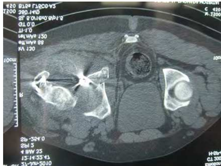
Fig. 3. axial CT scan.

Iliac and Obturator views of pelvis and acetabulum can show more details of columns and walls (anterior and posterior) and bony union of acetabulum. Computerized Tomography scan (CT scan), specially axial cuts, can show the quality and quantity of posterior wall and column and union of them. Also, exact position of hardwares( plates and screws ) can be showed. It can be estimated if plates and screws may interfere with joint arthroplasty specially insertion of acetabular cup. Medial wall of acetabulum and its integrity can be shown with axial CT scan.