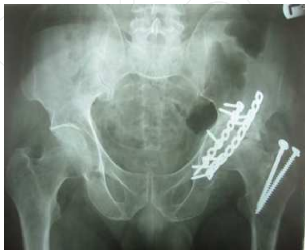
Fig. 1. Avascular necrosis of head of femur.

In post operative period, acutely or chronically, there may be some complications which may be solved by total hip replacement. One of them is avascular necrosis of head of femur. Some acetabular fractures are truly fracture dislocations and even after reduction and rigid fixation, because of injury to vascular supply of head of femur, necrosis and collapse of head of femur develop in early period or as a late complication. Specially with posterior approach to hip joint (Kocher langen beck approach), there may be injury to main vascular supply of head of femur (medial femoral circumflex artery). With disruption of blood input to the head of femur, signs and symptoms of necrosis will be appeared. Because of rapid progression of collapse and joint destruction in these cases, minor surgeries like core decompression and osteotomies are ineffective and finally total joint replacement is inevitable.