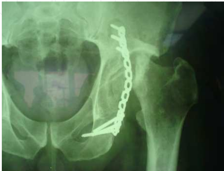
Fig. 4. bone defect of acetabulum.

of them with structural bone (allograft or autograft), if it is large and bone contact between host bone and cup is minimal (less than 30%), it may compromise osteointegration and also the cup can not be inserted with press fit technique, so cemented cup is preferred. It is accepted that if more than 1/3 of cup is in contact with graft, it is better to use cemented prosthesis. About femoral stem, because of younger age of these patients, nearly always it is better to use cementless stems.