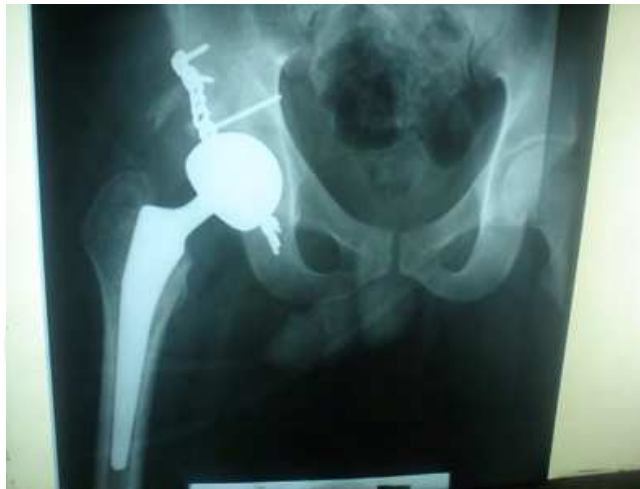
Fig. 7. Bipolar prosthesis for avascular necrosis of head of femur after acetabulum fracture fixation.