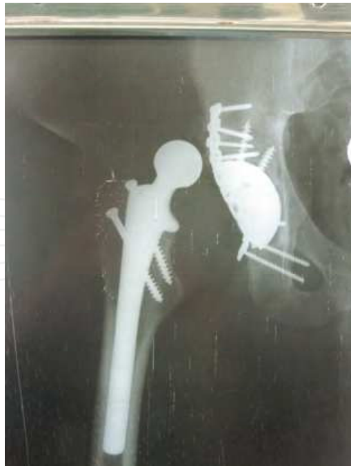
Fig. 9. Dislocation of total hip prosthesis.