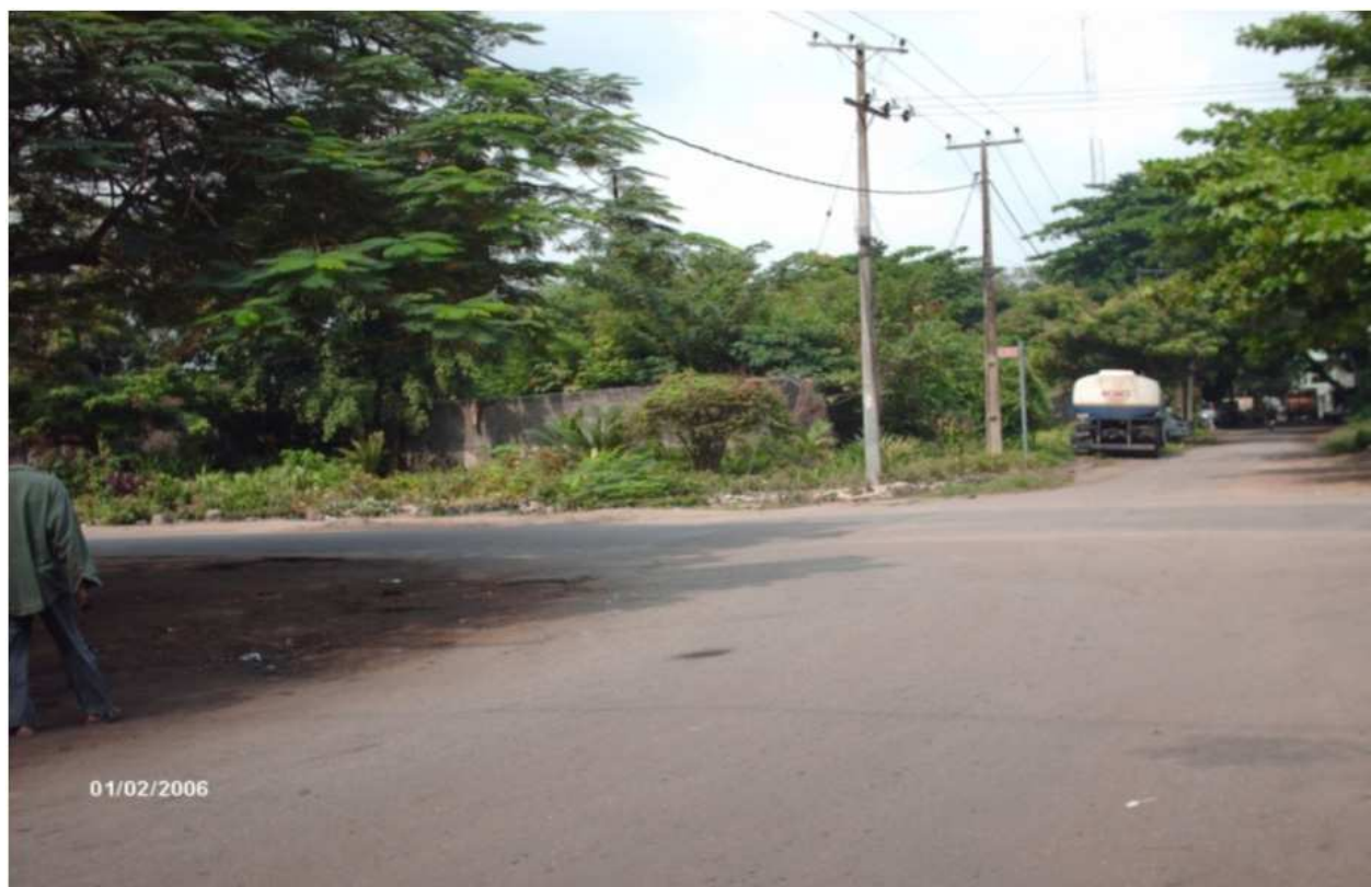
Plate 1. One of the Commercial Horticulture Gardens, together with Trees planted for Public use along the Street in Eti-Osa Local Government Area, Lagos State, Nigeria.