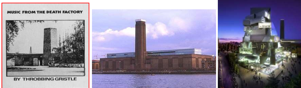
Fig. 3. Flyer - Tate Modern 1 - Tate Modern 2

Tate2 is an ubiquitous being and every floor is a dissonant montage of co-present multilevel identities.