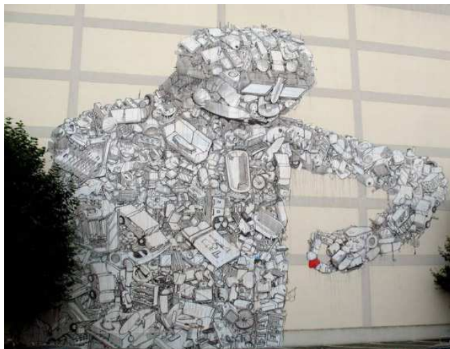
Fig. 1. Bluewallberlin (Blu: 2011)

Ethnography as method has been changing in recent years for many reasons and in different cultural contexts. Bororo, Xavante or Kayapò – if I focus exclusively Brazilian cultures with whom I've been doing research in a "native" fieldwork – are increasingly involved on presenting their rituals by themselves through digital technologies; the same is occurring inside urban youth cultures and their self-production on music, street art, style or expanded design and so on, whose languages are understandable only through their autonomous visions and reflections; transurbanism is their ethnographic fluid context (Mudler: 2002). This accelerated trans-cultural process is spreading out new kinds of subjectivities as well as diasporic citizenship through digital communication.