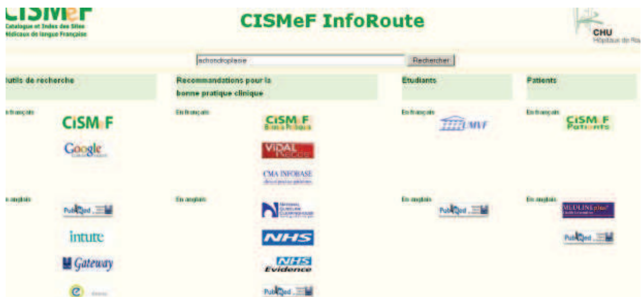
Fig. 3. CISMeF InfoRoute.