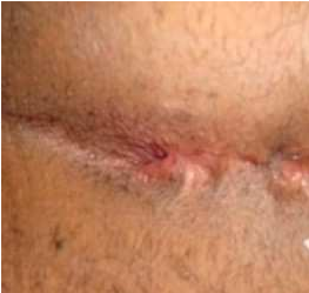
Fig. 3. Recurrent PNS with scarring and fistula.