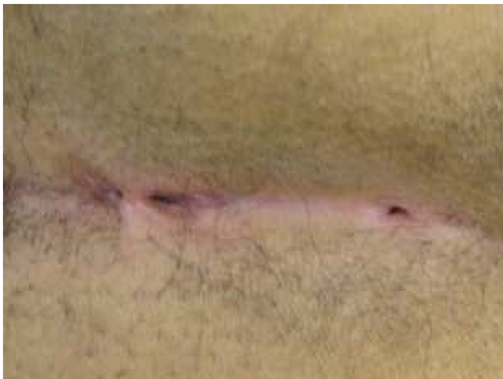
Fig. 2. Recurrent PNS.