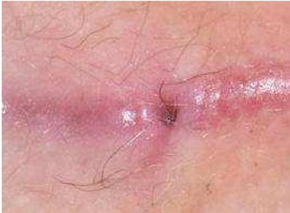
Fig. 1. PNS with hair protruding out of its opening.