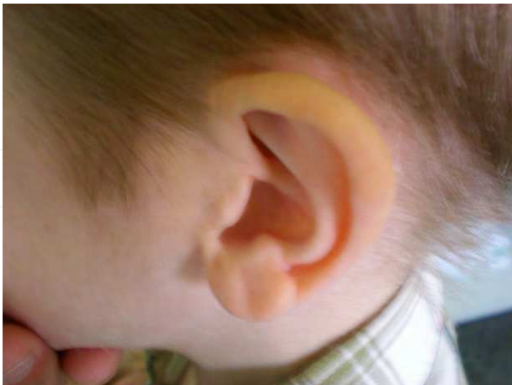
Fig. 3. Clinical facial features in MWS. The ear lobes are very typical. They are large and uplifted with a central depression and have been described as being like "orecchiette pasta" or like "red blood corpuscles" in shape. They do not change significantly with time (with the exception of the central depression, which is less obvious in adults) and are an excellent diagnostic clue

However, the distinct facial features of MWS, in addition to the other typical congenital anomalies, should allow distinguishing these two conditions. Differential diagnosis is also necessary for MWS patients presenting with hypospadias and mental retardation to avoid misdiagnosis as Smith-Lemli-Opitz syndrome, Opitz G/BBB syndrome or X-linked mental retardation-alpha thalassemia syndrome. Again, facial phenotype should be the clue for correct diagnosis.