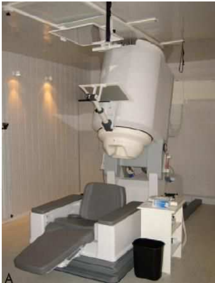
Fig. 1. A, Biomagnetometer in a electrically shielded room. Patients can be comfortably studied in a seated or supine position.

Once of the aspects in which MEG can more quickly define its contributions are without and doubt its application to presurgical study of patients with epilepsy resisted to medical treatment (Shibasaki,et al., 2007).